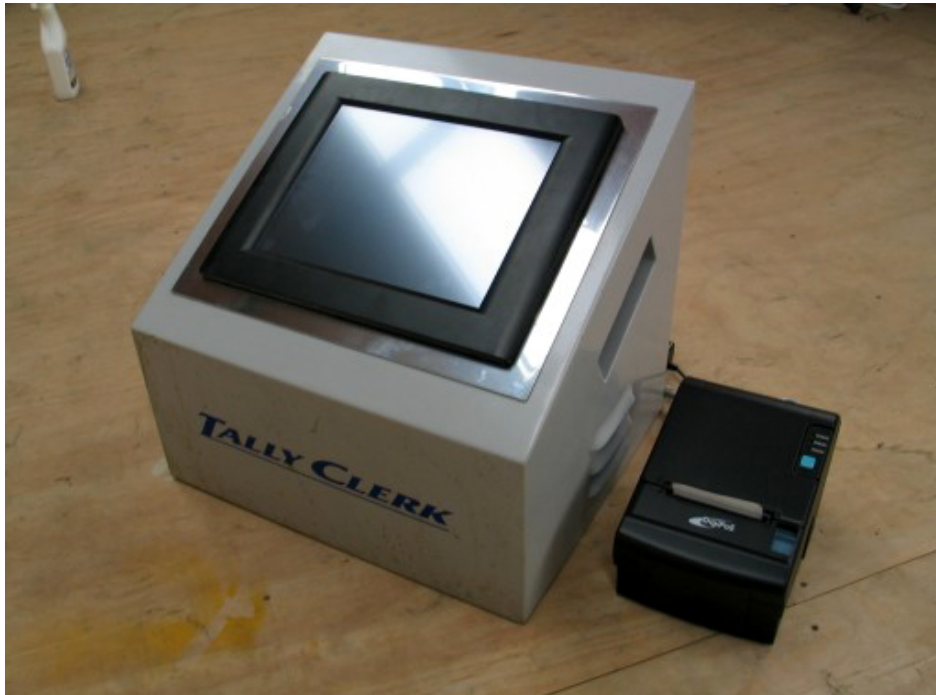
FIGURE 13/1/15 – 2