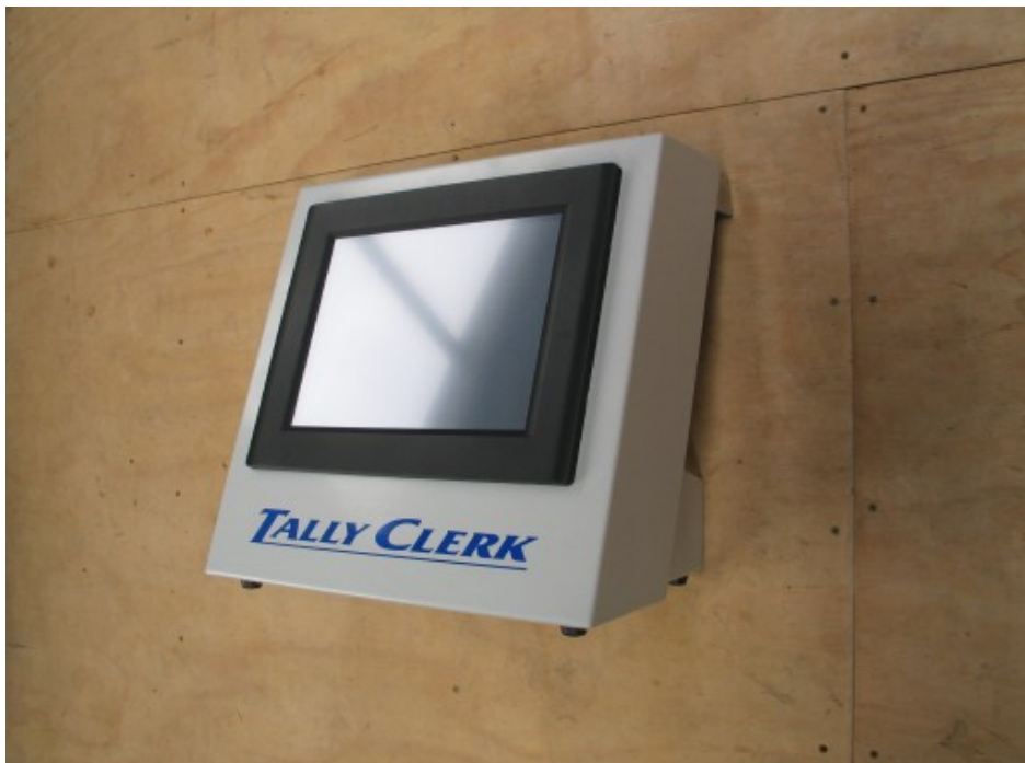
Tally Clerk Model LVS Operators Console (Typical Alternative Housings)