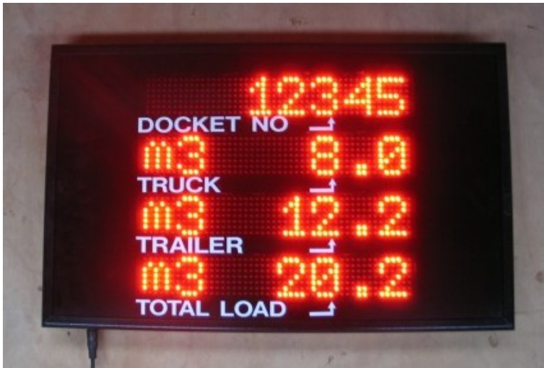
FIGURE 13/1/15 – 3