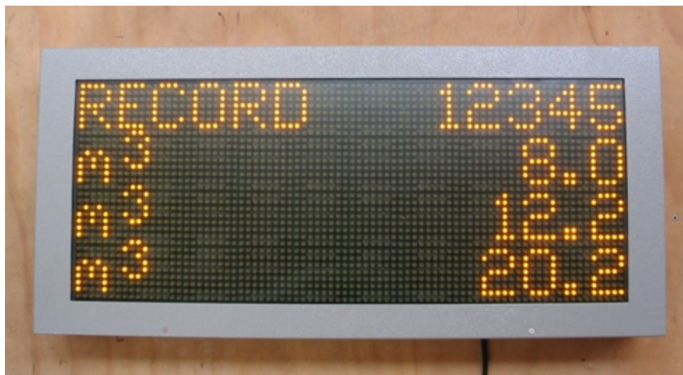
Typical Alternative PolyComp LED Message Board Indicators