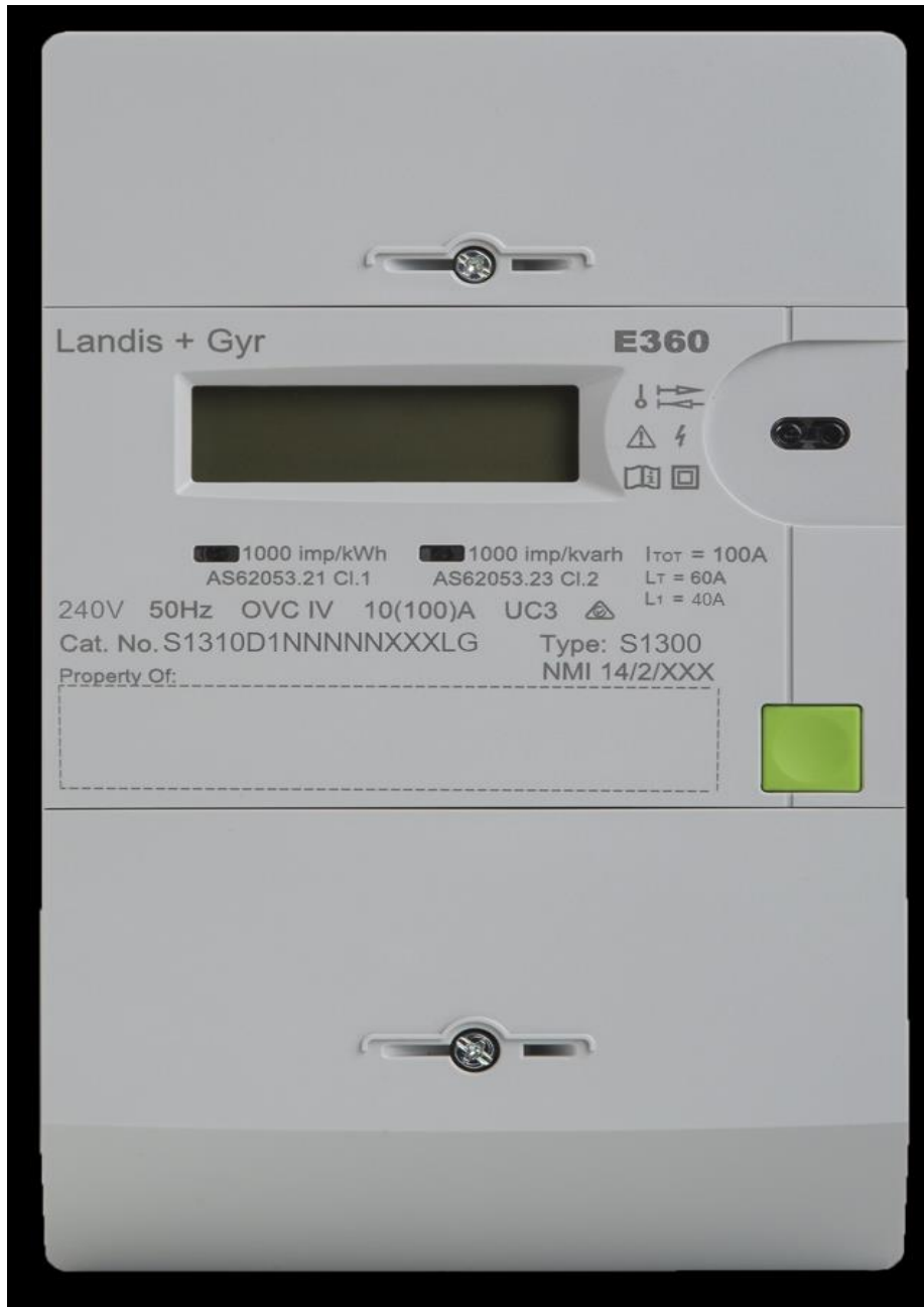
Landis+Gyr Pty Ltd model E360 (Series 1) Type S1310 Electricity Meter (Variant 1)