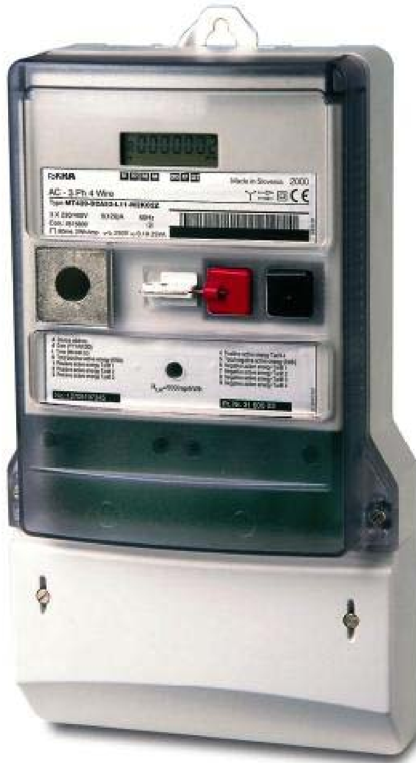
ISKRA Model MT420-D2A41-M2K02Z Electricity Meter