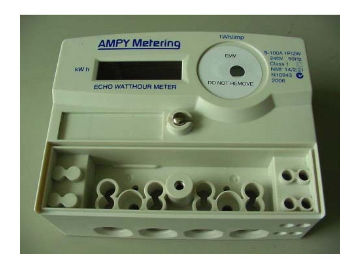
FIGURE 14/2/21 - 1