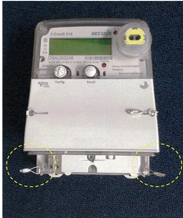
FIGURE 14/2/86 – 2