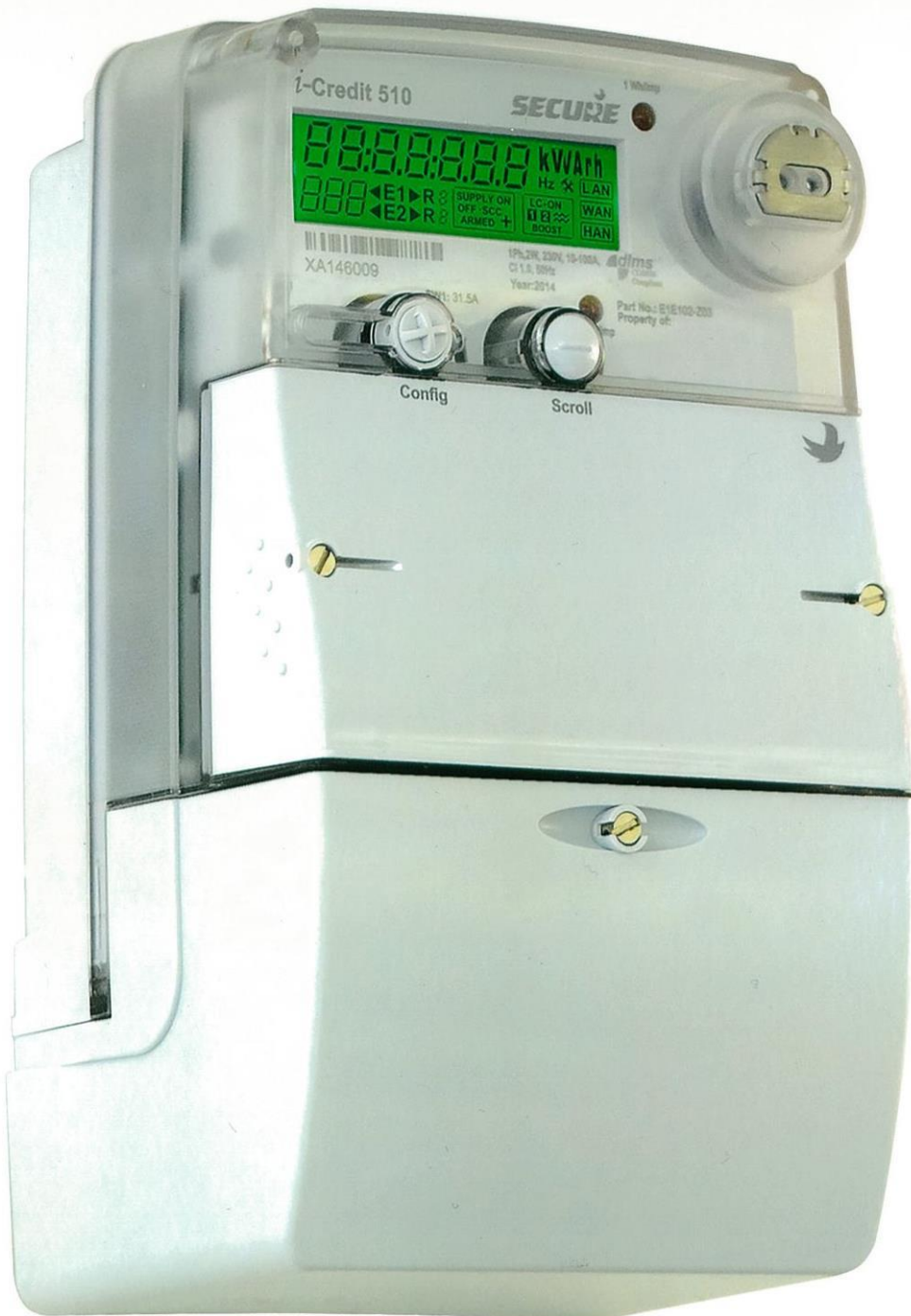
Secure Model i-Credit 510 Electricity Meter (The Pattern)