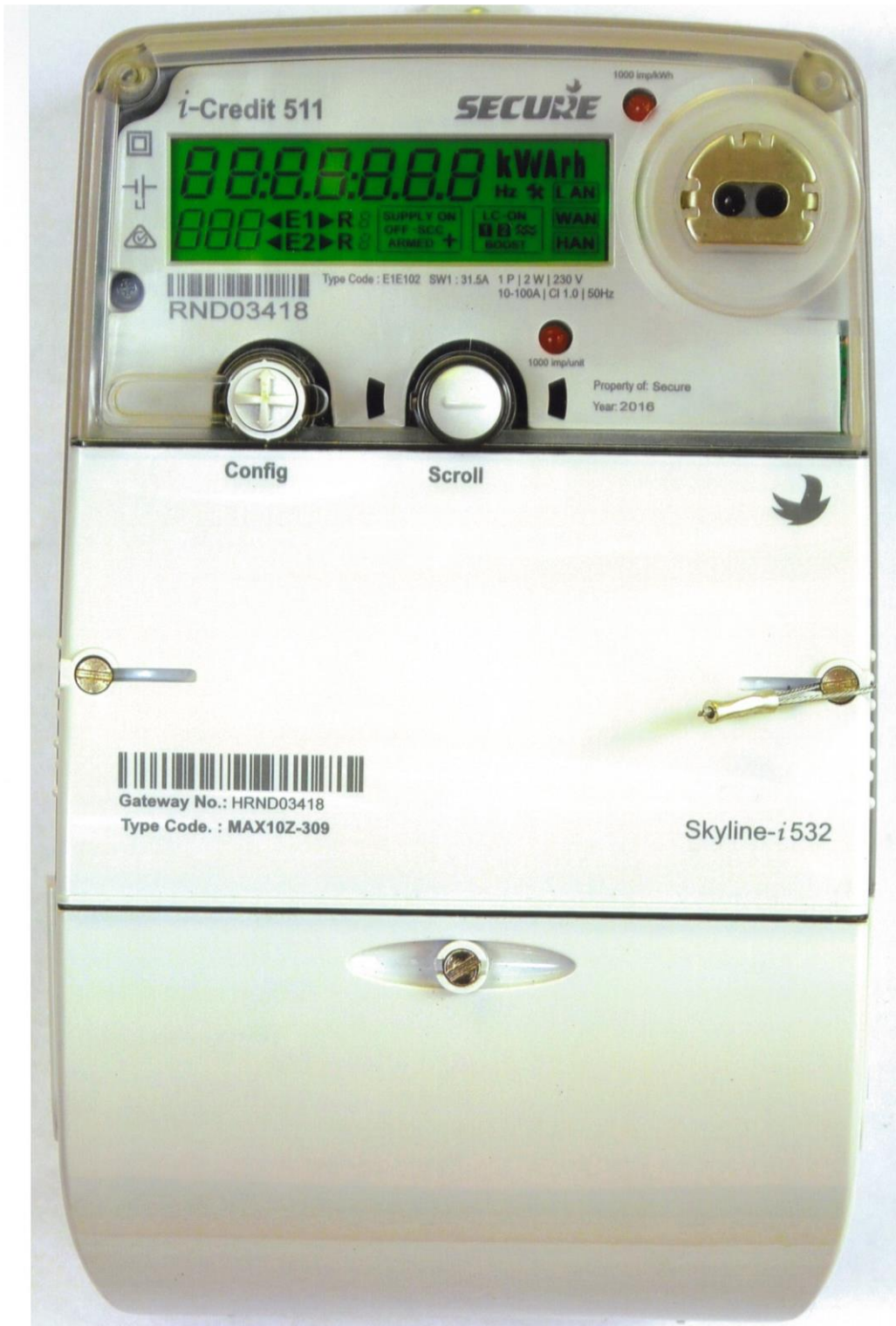
Secure Model i-Credit 511 Electricity Meter (Variant 2)