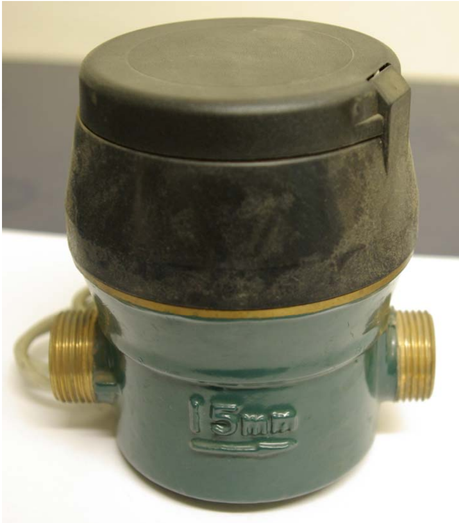
FIGURE 14/3/14 – 1