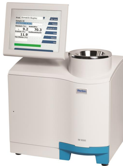
Perten Instruments Model Inframatic IM 9500 HLW/TW