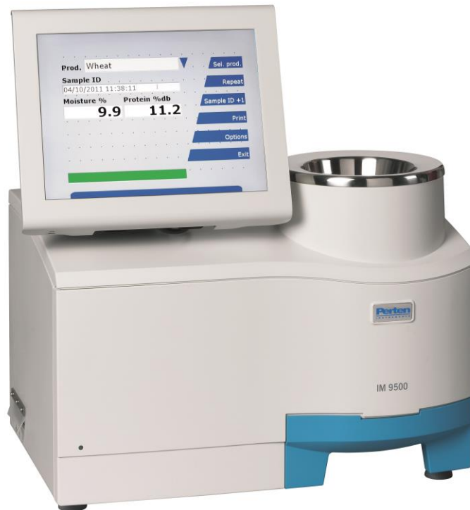
Perten Instruments Model Inframatic IM 9500 Grain Protein Measuring Instrument