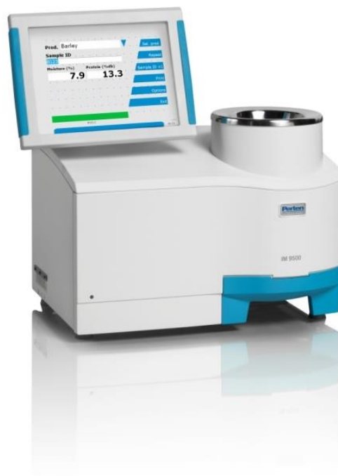
Perten Instruments Model Inframatic IM 9500 Plus