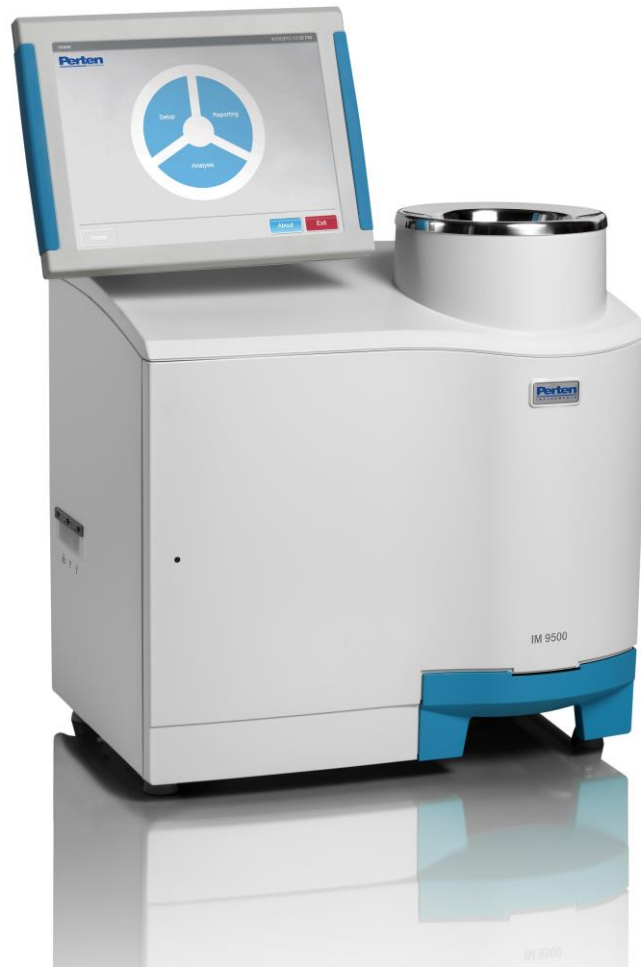
Perten Instruments Model Inframatic IM 9500 HLW/TW Plus