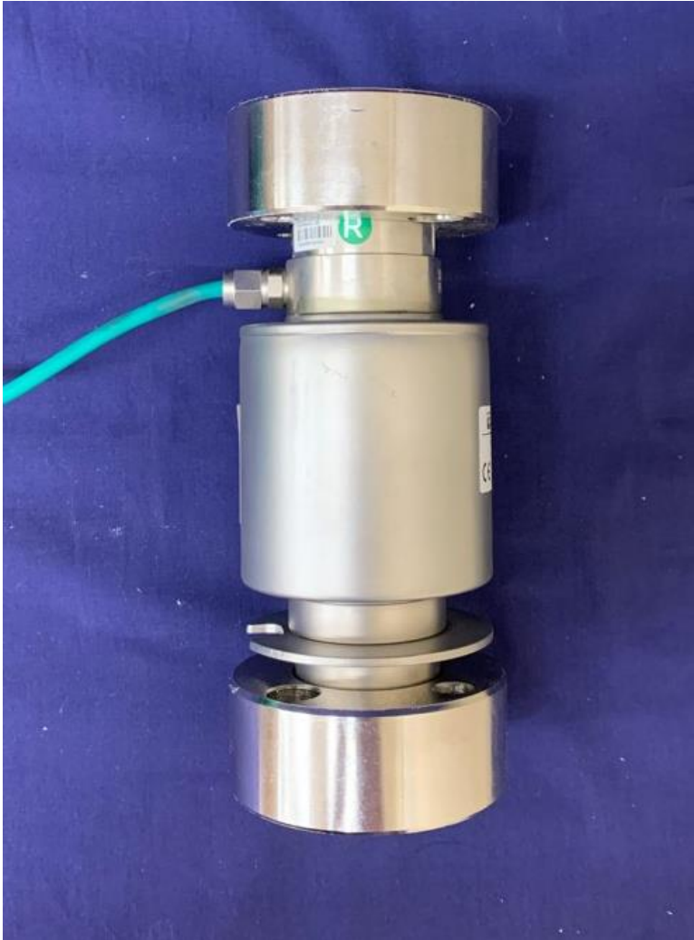
Dini Argeo Model RCPTD30C4-2 Load Cell