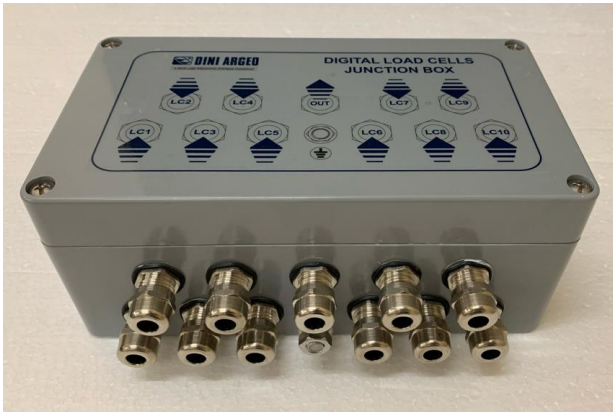
Dini Argeo Model JB10QD-1 Digital Load Cell Junction Box