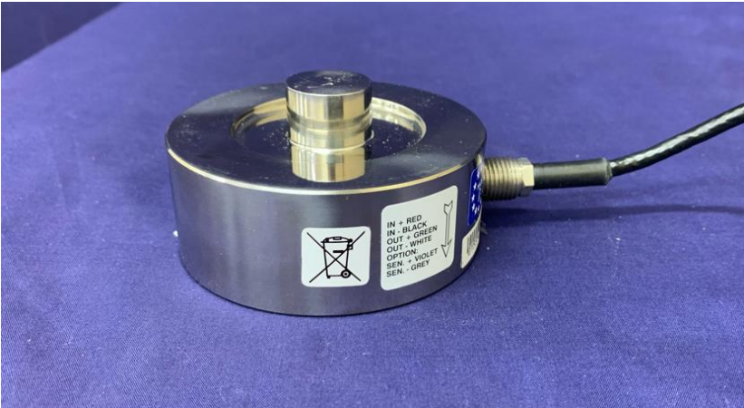
Dini Argeo Model CPA Load Cell