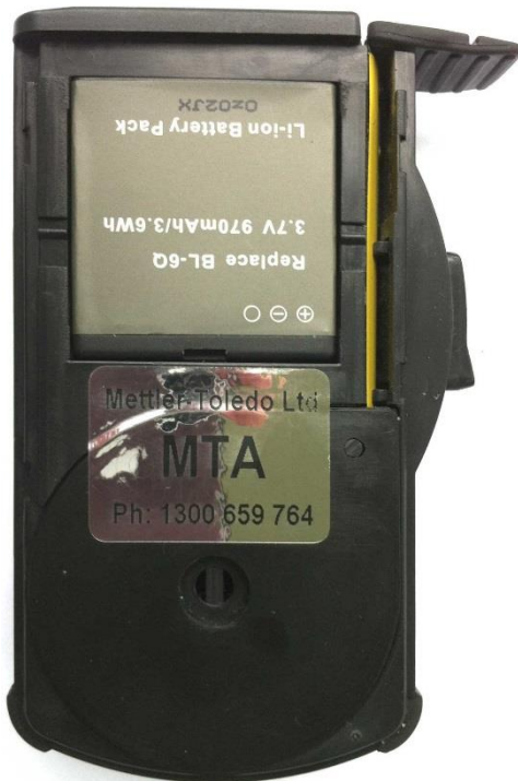
(d) Typical Sealing