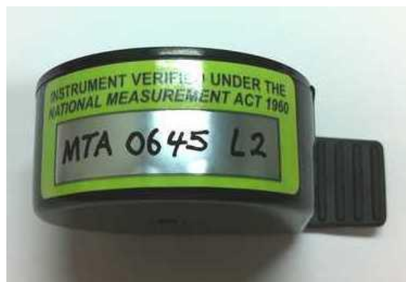
ParcelTools Australia Model C190T Replacement Tape Cassette (Variant 2)