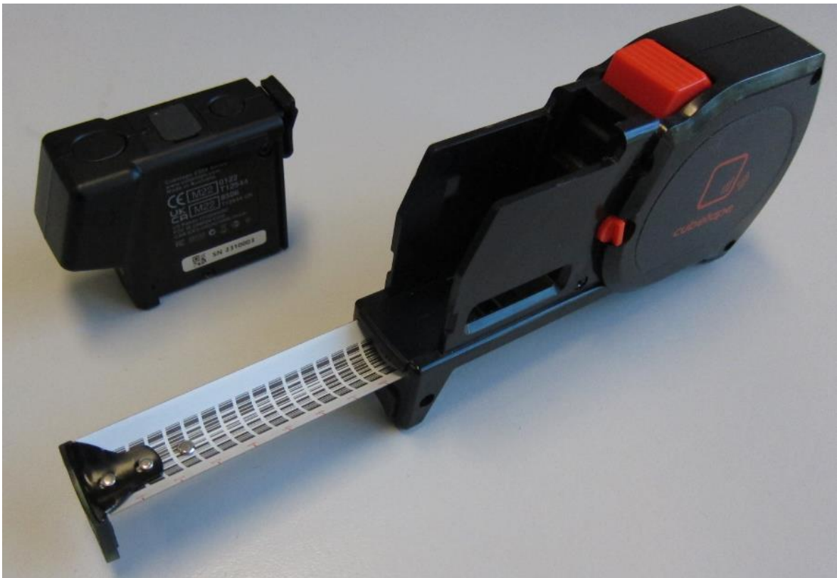
C200 with C200 tape cassette (Variant 7)