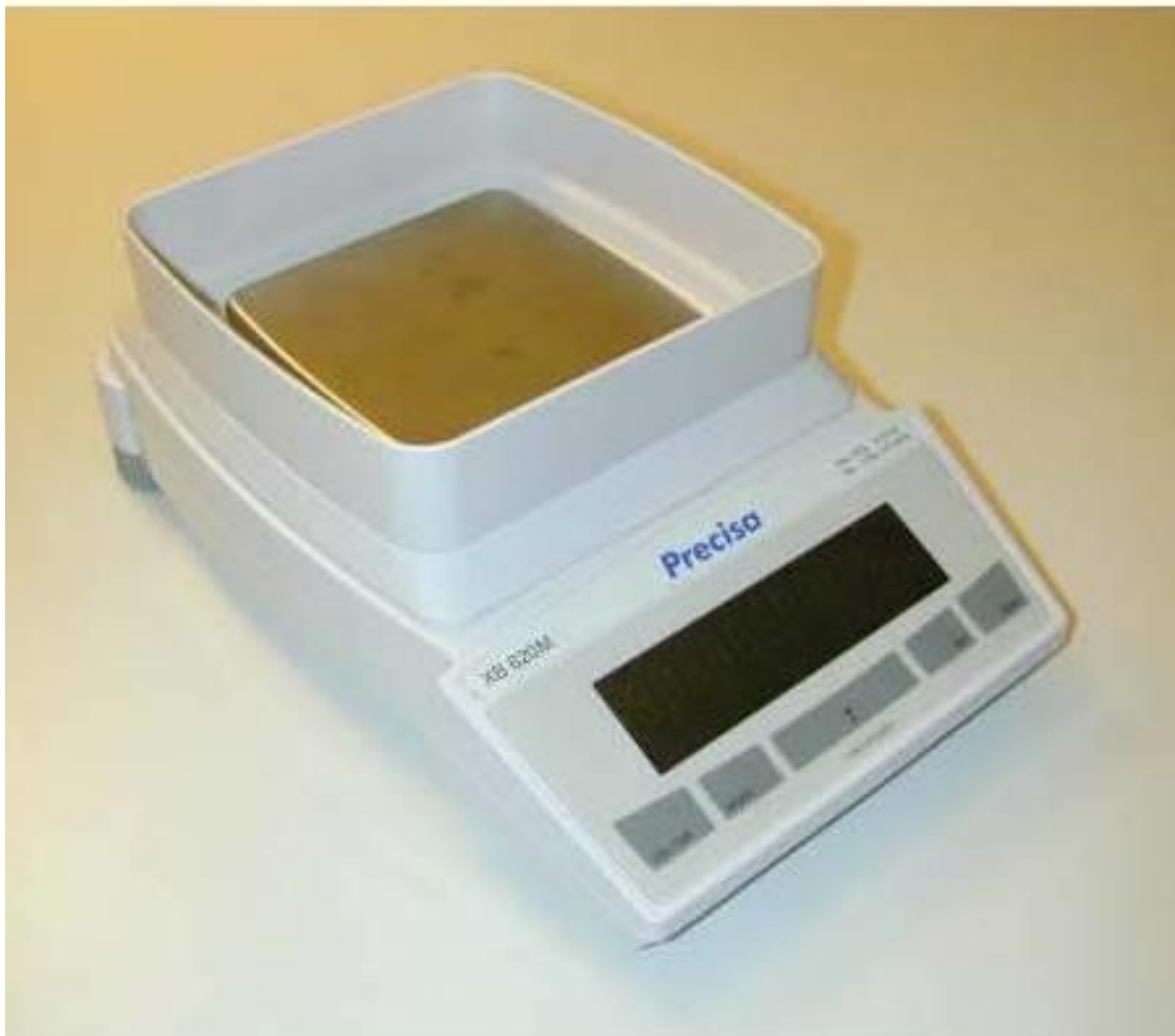
Precisa Instruments 320 XB 620M Weighing Instrument