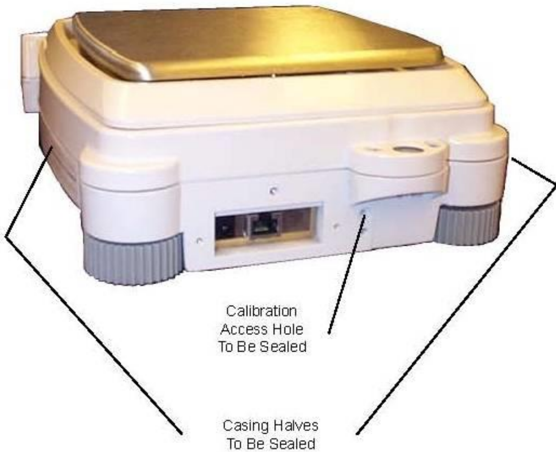
Typical Sealing Arrangements