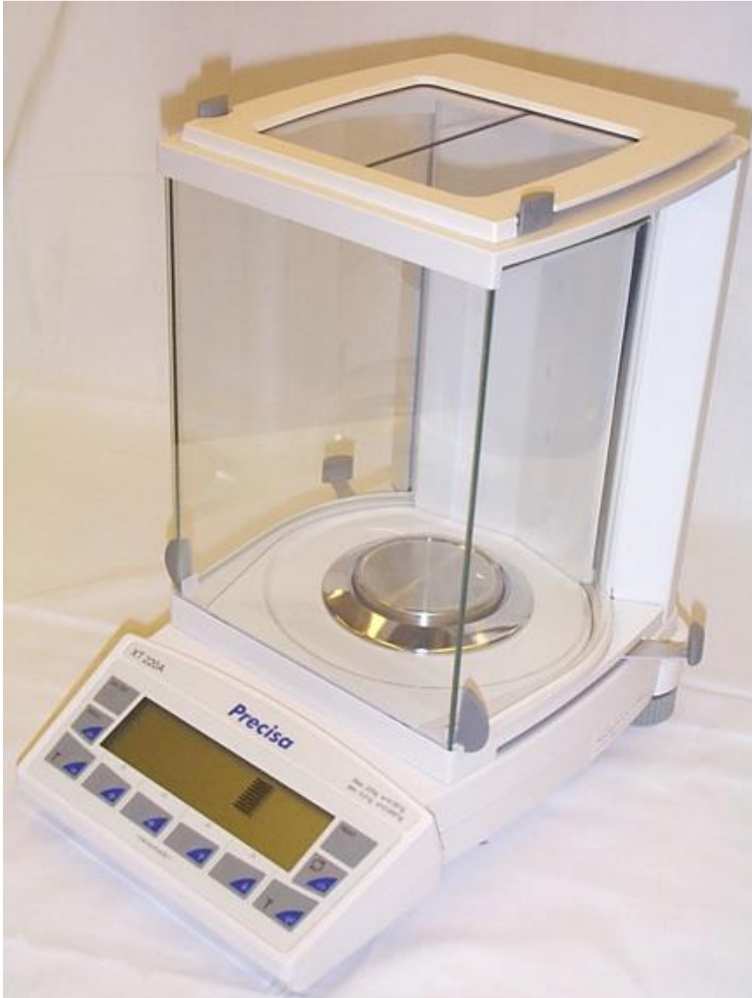
Precisa Instruments 320 XT 220A Weighing Instrument