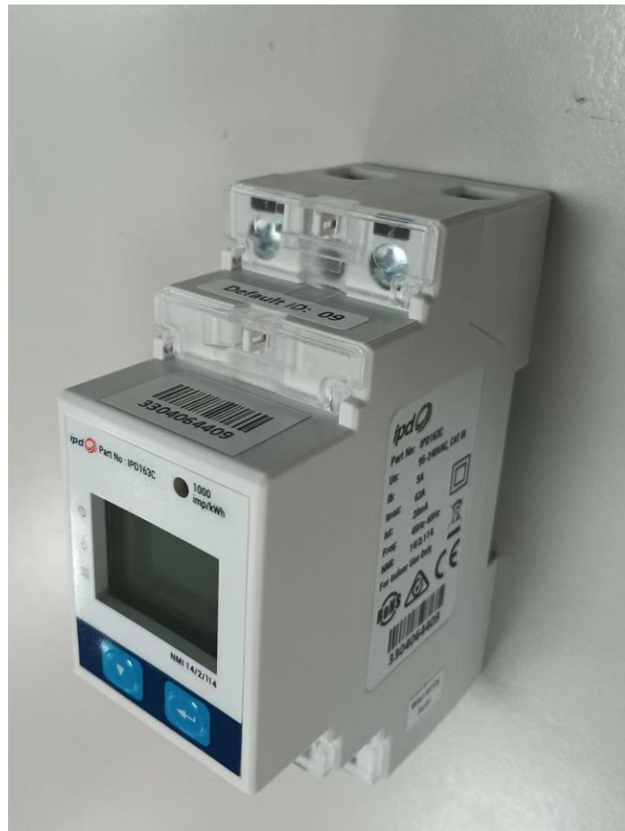
Variant 1 - CET ELECTRIC TECHNOLOGY INC. model IPD163C Electricity Meter