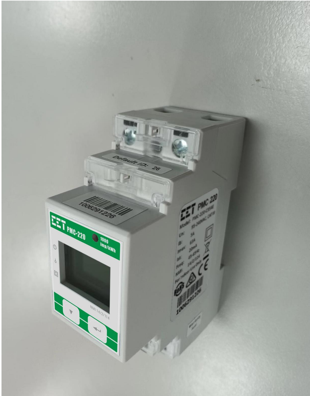
CET ELECTRIC TECHNOLOGY INC. model CET PMC-220-C35AE Electricity Meter