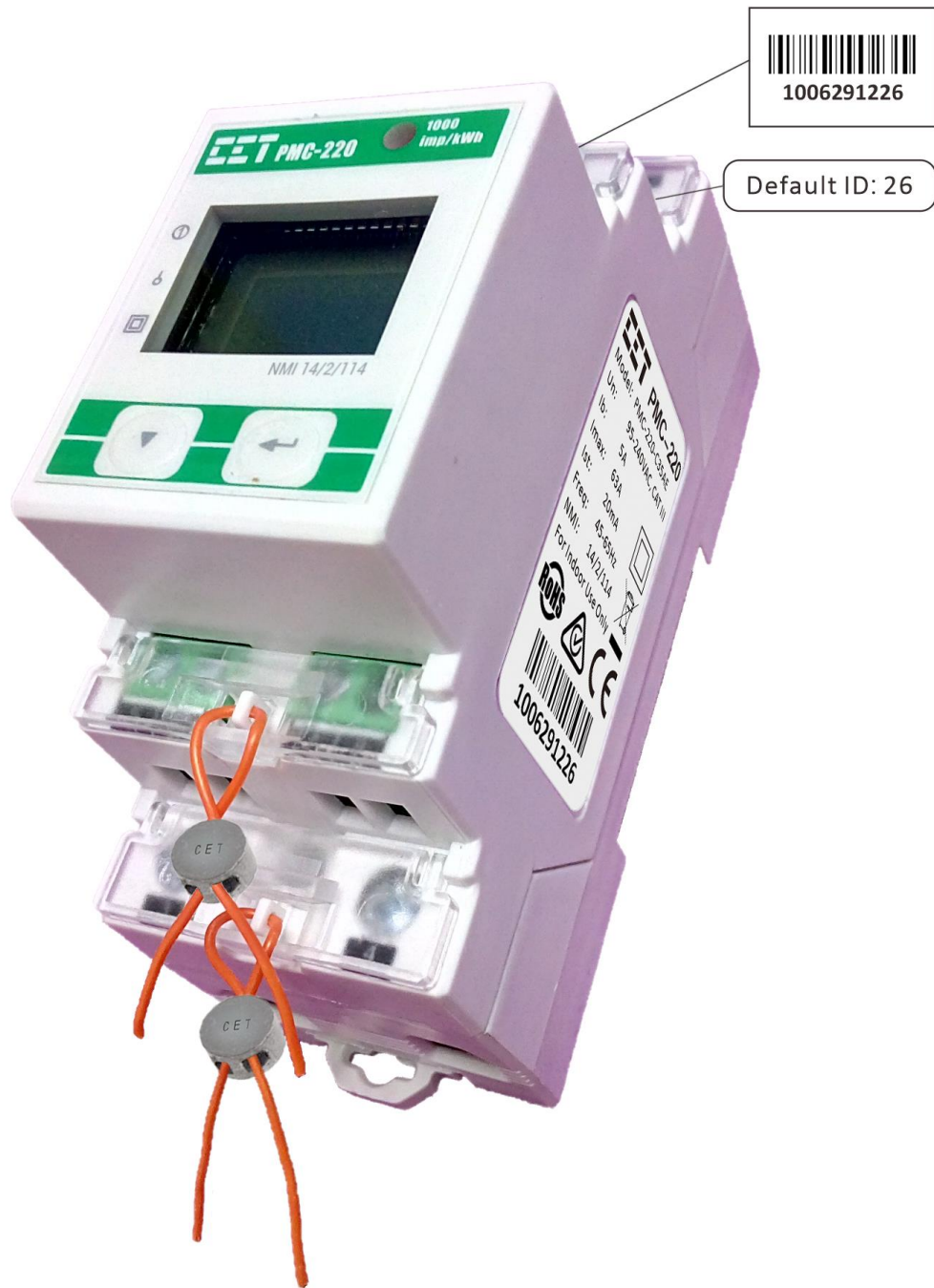
CET ELECTRIC TECHNOLOGY INC. model CET PMC-220-C35AE Electricity Meter Showing Markings and Including Typical Mechanical Sealing