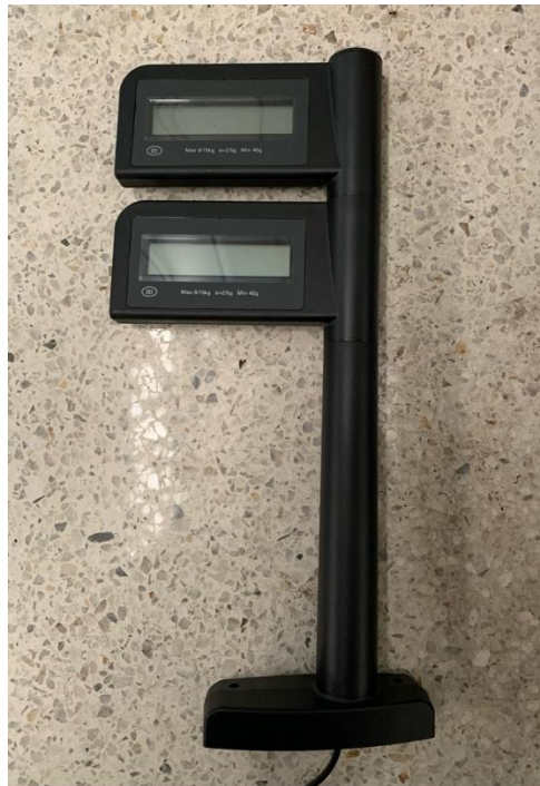
(b) Zebra Technologies Model MX 204 Dual Display