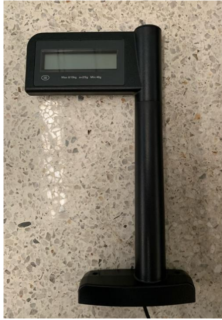
(a) Zebra Technologies Model MX 203 Single Display