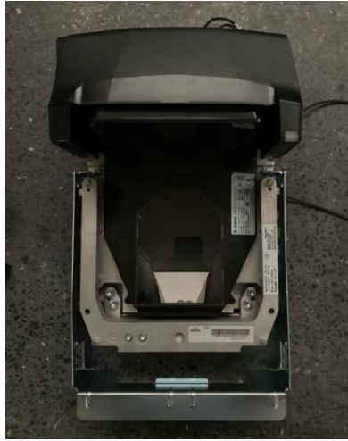
Zebra Technologies Models MP70X1 & MP70X2 Series Fitted With a Shekel 20-MP7-M30-05 Digital Load Cell With Load Receptor Plate Removed