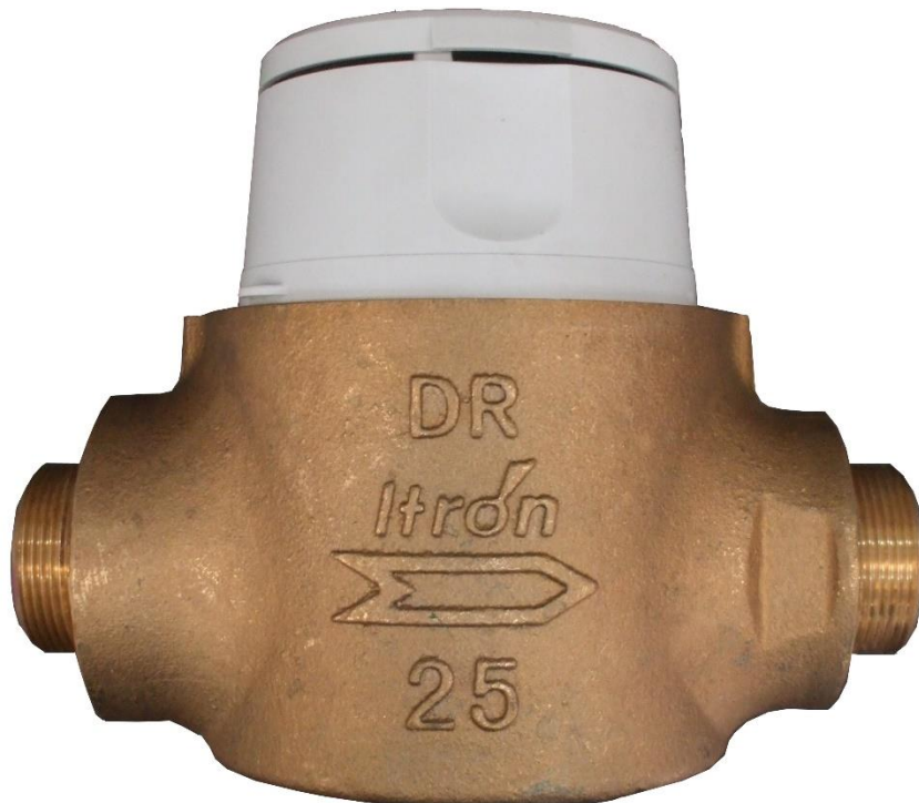
Itron TD8 DN25 water meter (the pattern)