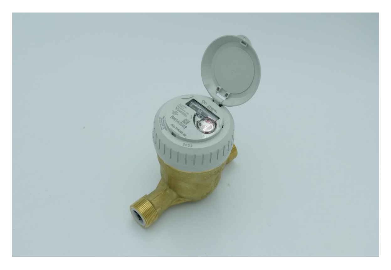
Diehl Metering ALTAIR DN20 water meter (the pattern)