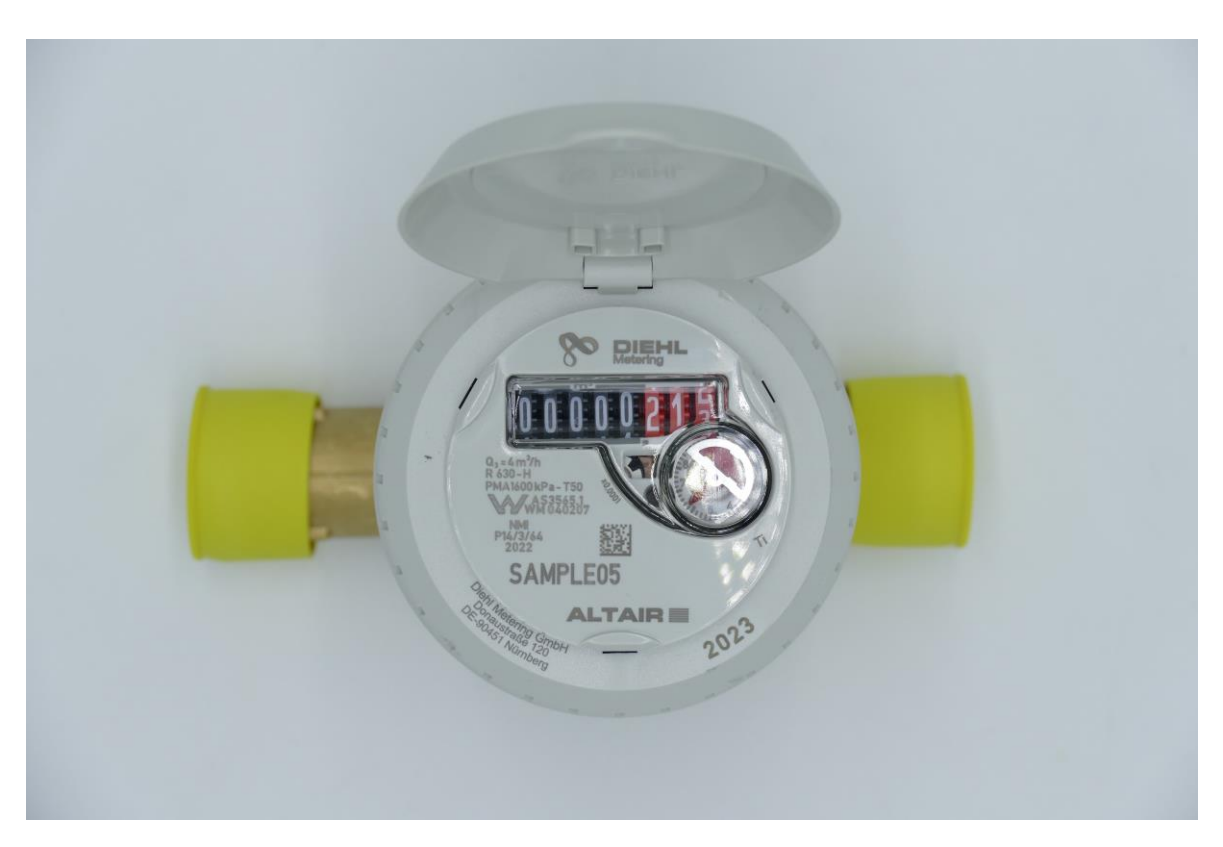
Indicating device and example of required markings