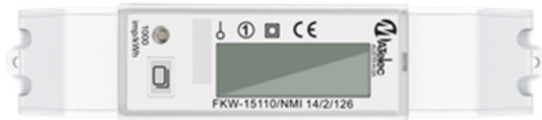
MATElec Australia model FKW-15110/NMI electricity meter