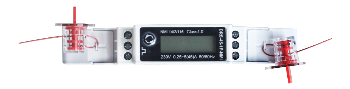
FIGURE 14/2/116 - 1

Tyco Electronic (TE) model DRS-45-1P-NMI Electricity Meter (the pattern, including typical mechanical sealing)