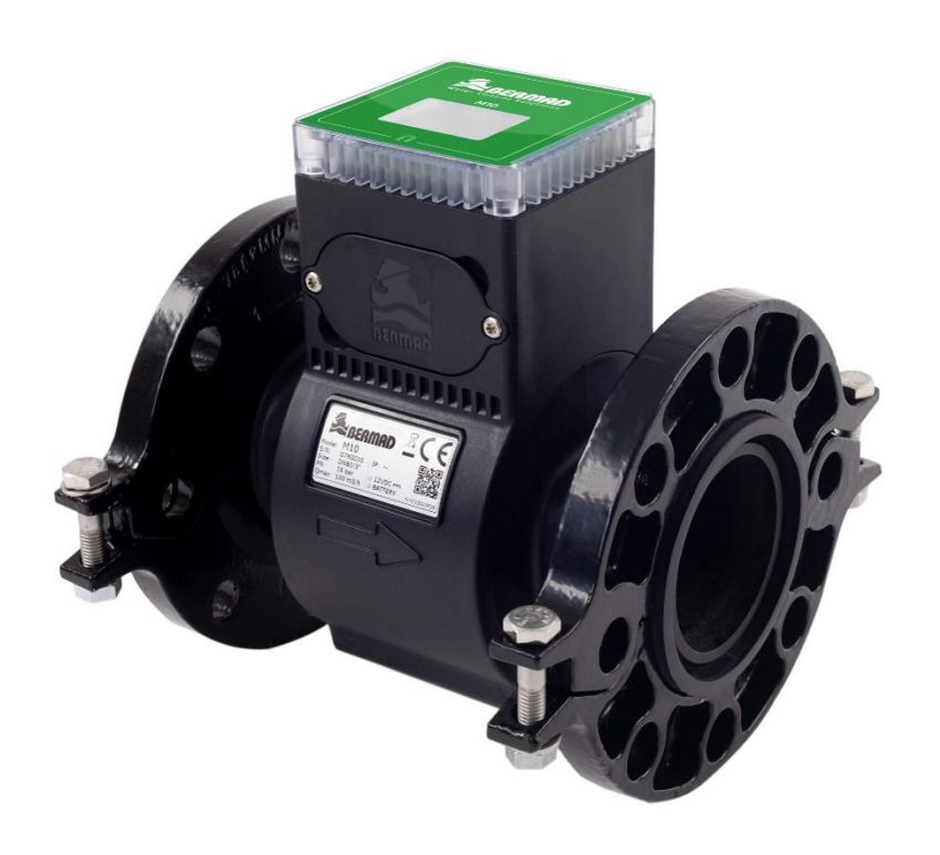
FIGURE 14/3/71 – 1

Water Meter Technologies Bermad M10 water meter (the pattern) fitted with flanged end connections