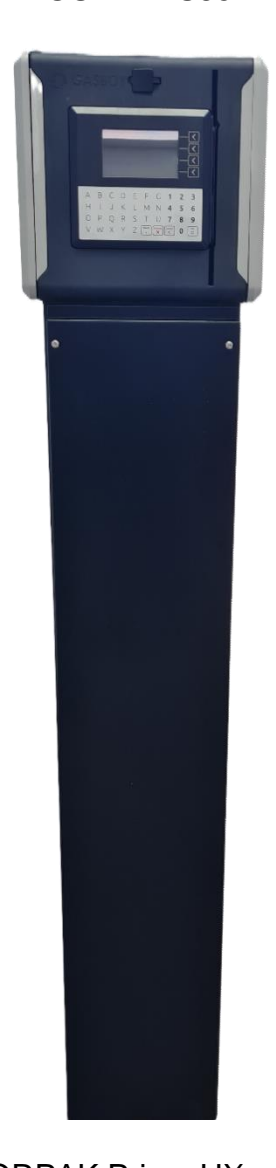
Typical ORPAK Prime UX with Pedestal