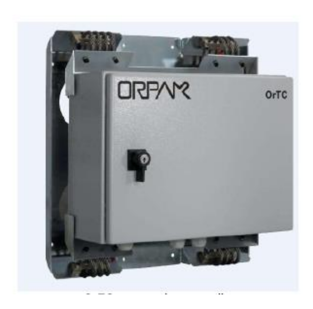
Prime forecourt controller Stand-alone Control System