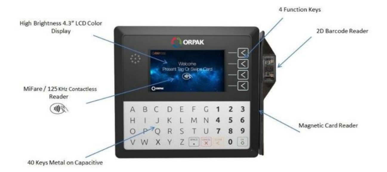
Typical ORPAK Model OrPAY1000 Terminal Installations in Various Fuel Dispensers