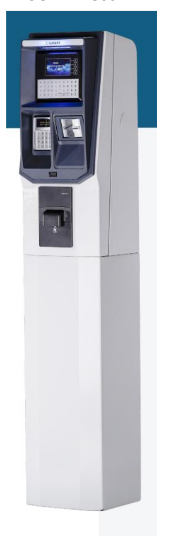
Typical ORPAK Model ORIC Prime Payment Terminal