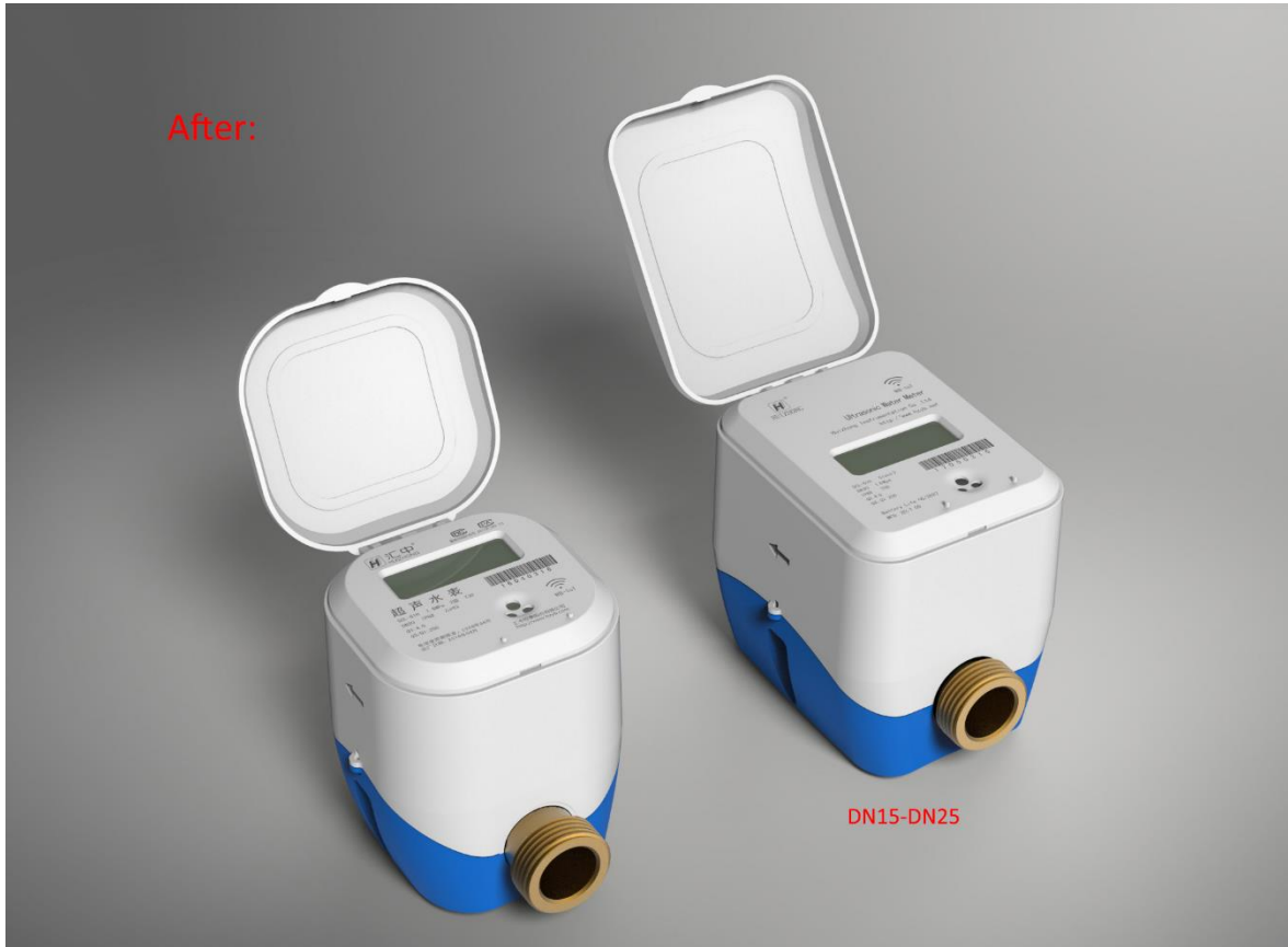
SCL-61H Residential Ultrasonic Water Meter – both housings