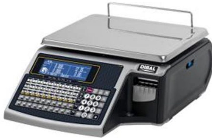
(a) Dibal Model S-545/M-525 Bench Type Weighing Instrument (Pattern)