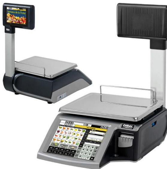
Dibal Model D-955 Pole Type Weighing Instrument (variant 8)