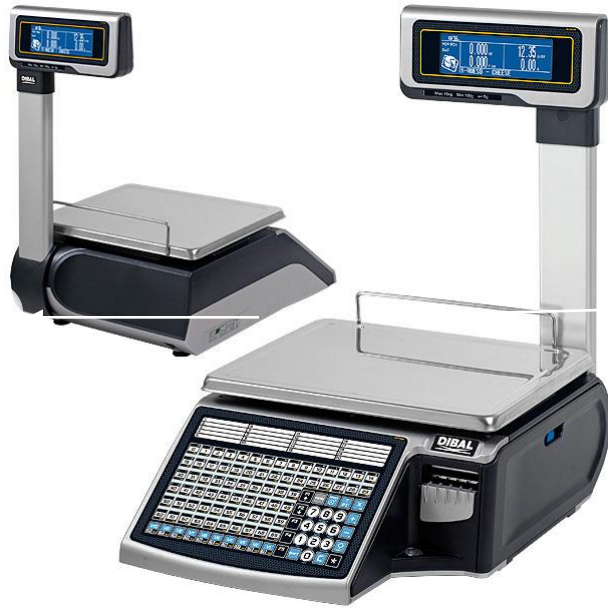
(a) Dibal Model S-545/M-525 Pole Type (variant 4)