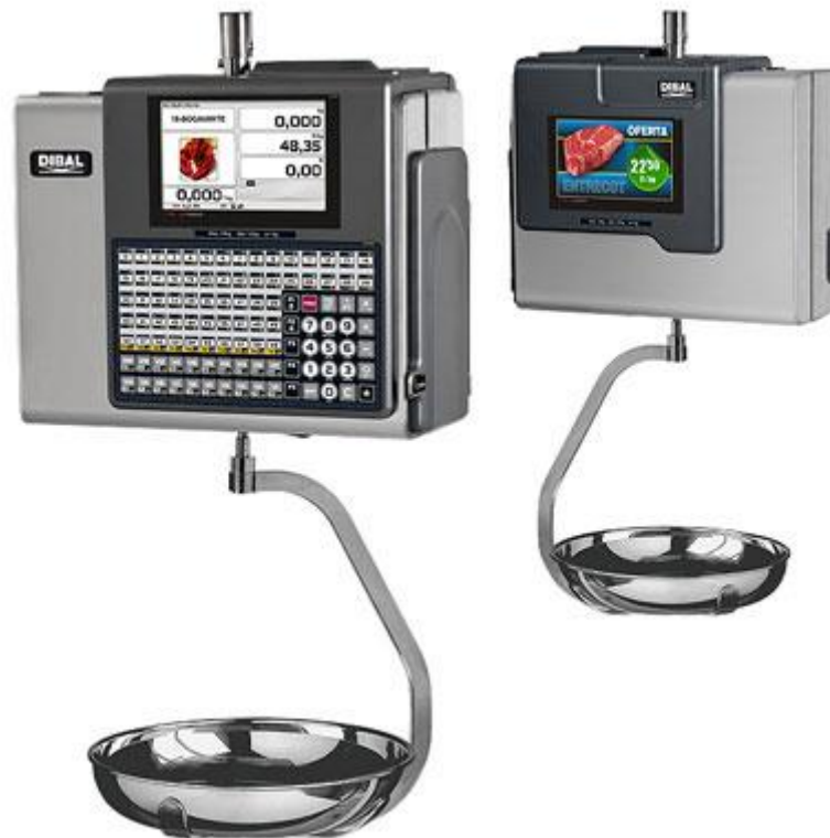
(b) Dibal Model S-545/M-525 Hanging Type With LCD Displays (variant 5)