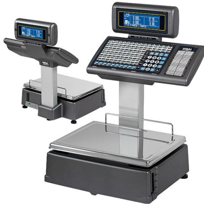
(a) Dibal Model S-545/M-525 Double Body Type (variant 5)