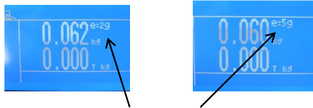
(b) Dibal Model S-545/M-525 Range Indication