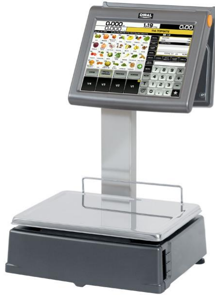
FIGURE 6/4D/385 – 8