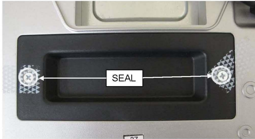
(a) Typical Sealing Arrangement – Bench Style Instruments