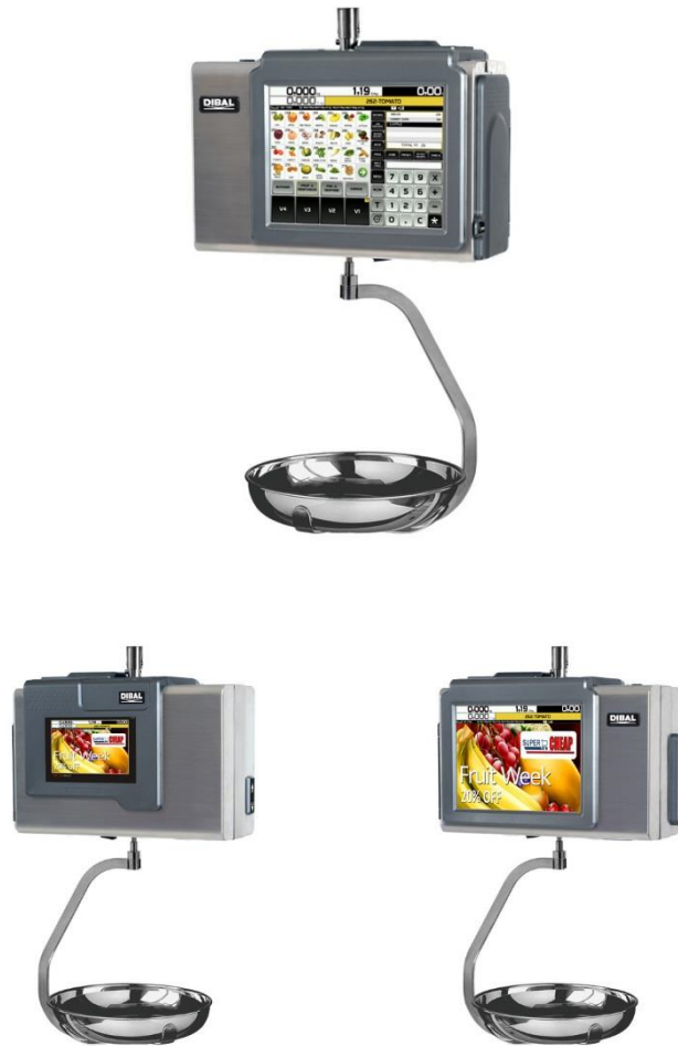
Dibal Model D-955 Hanging Type Weighing Instrument (variant 10)