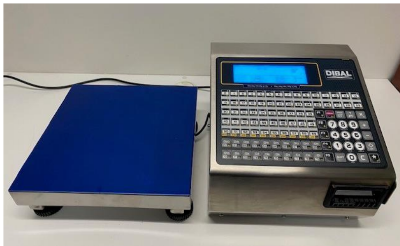
Dibal Model LP-545 External Platform Type Weighing Instrument (variant 12)