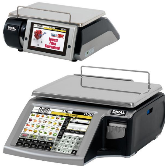
(a) Dibal Model D-955 Bench Type Weighing Instrument (variant 7)