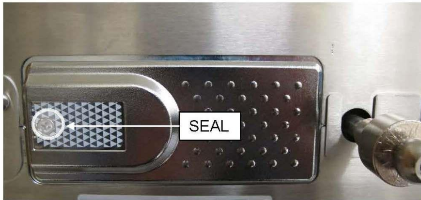
(b) Typical Sealing Arrangement – Hanging Style Instruments