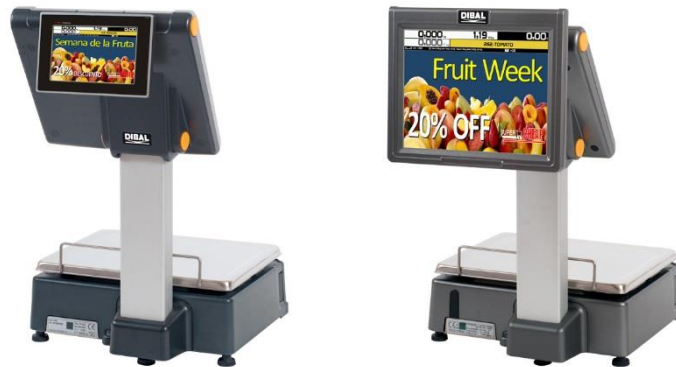
Dibal Model D-955 Double Body Type (variant 9)