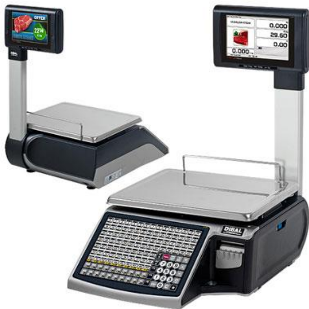
(b) Dibal Model S-545 Pole Type With LCD Displays (variant 4)