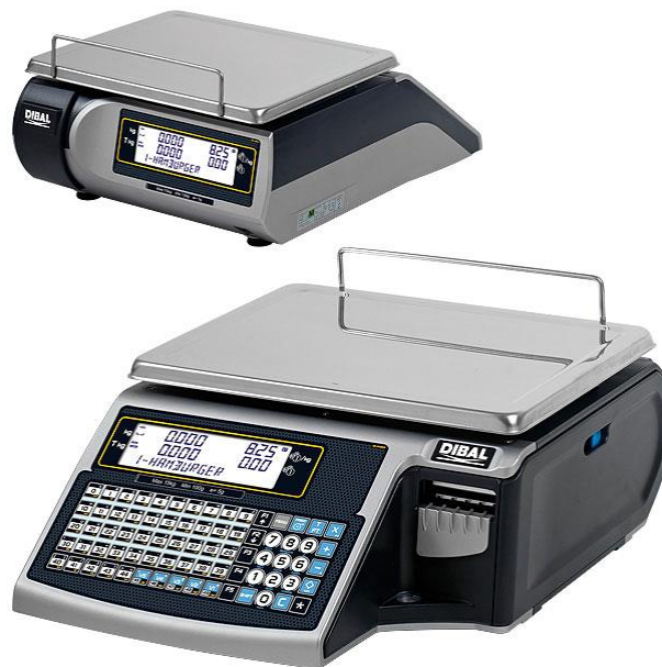
(c) Dibal Model S-545/M-525 Bench Type With 7 Segment LCD Displays