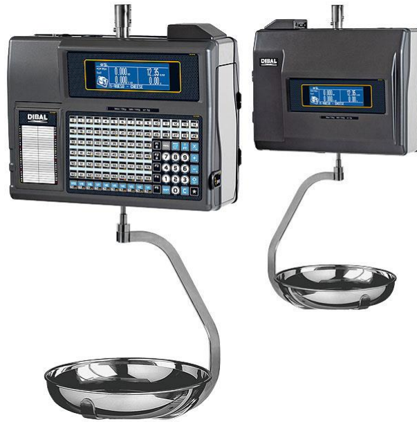
(a) Dibal Model S-545/M-525 Hanging Type Weighing Instrument (variant 6)