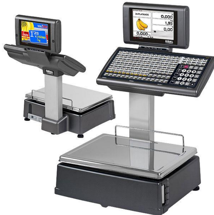
(b) Dibal Model S-545 Double Body Type with LCD Displays (variant 5)