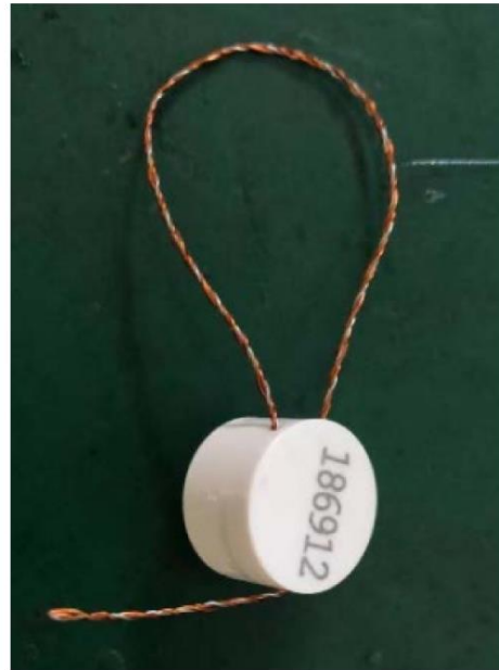
Mechanical tamper evident seals