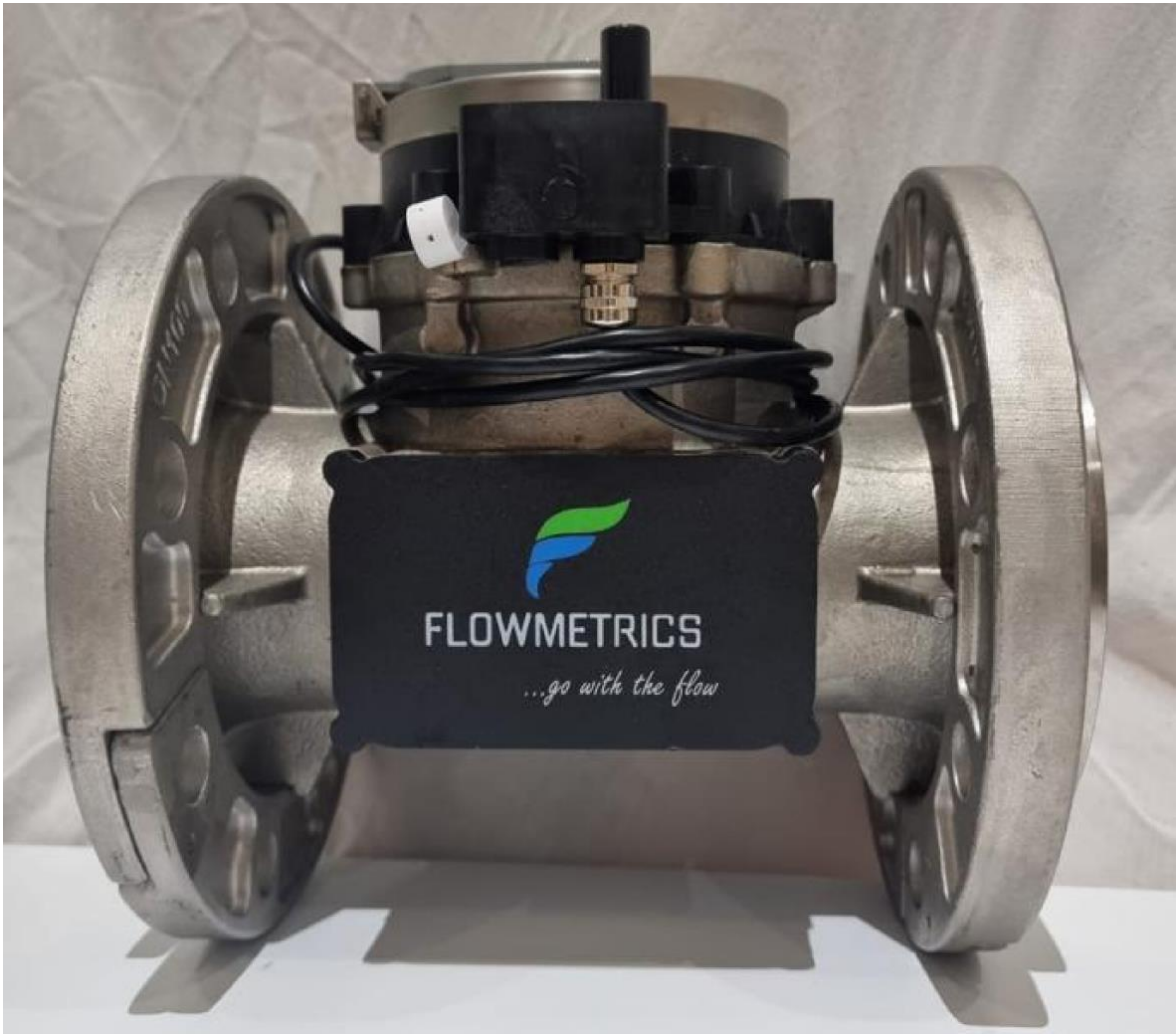
Example of DN100 sized meter – Variant 1