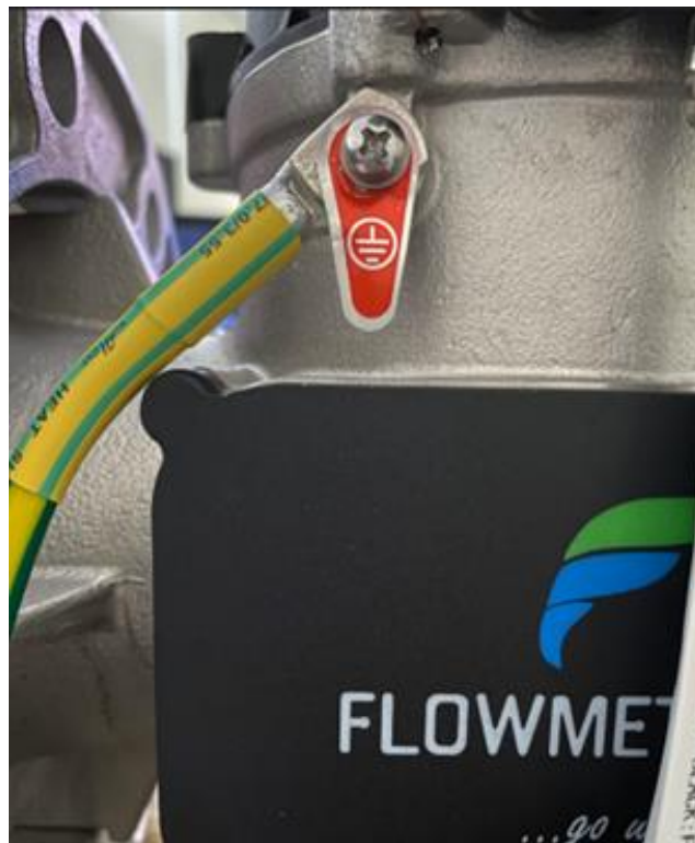
Grounding cable attached to meter grounding tear