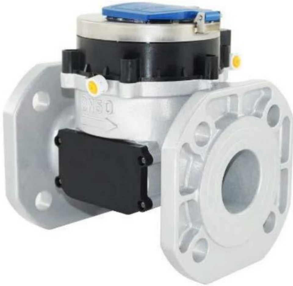
Flowmetrics DN50 F-NMIR-1049 model water meter – the Pattern