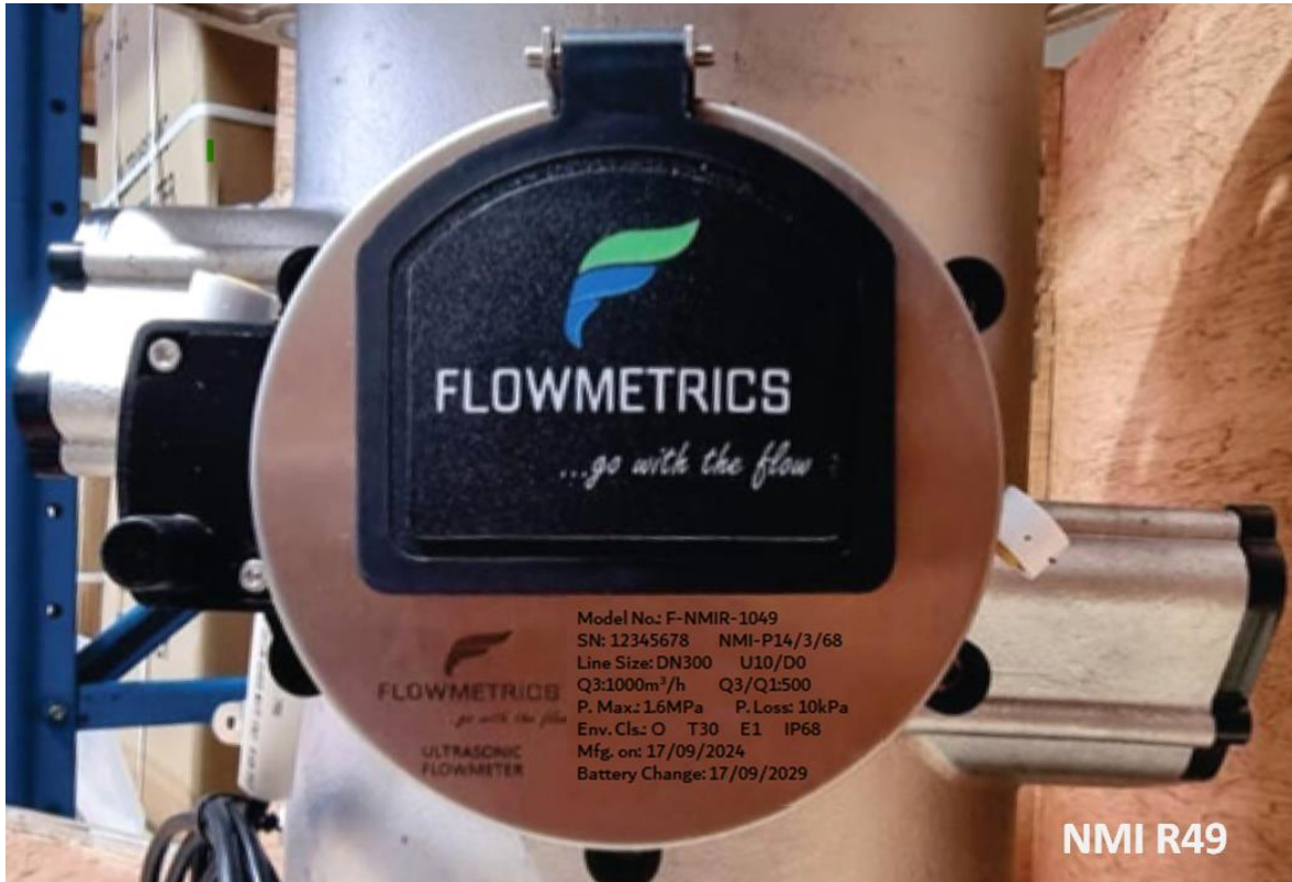
Example of required markings – Accuracy class 2 – Variant 2