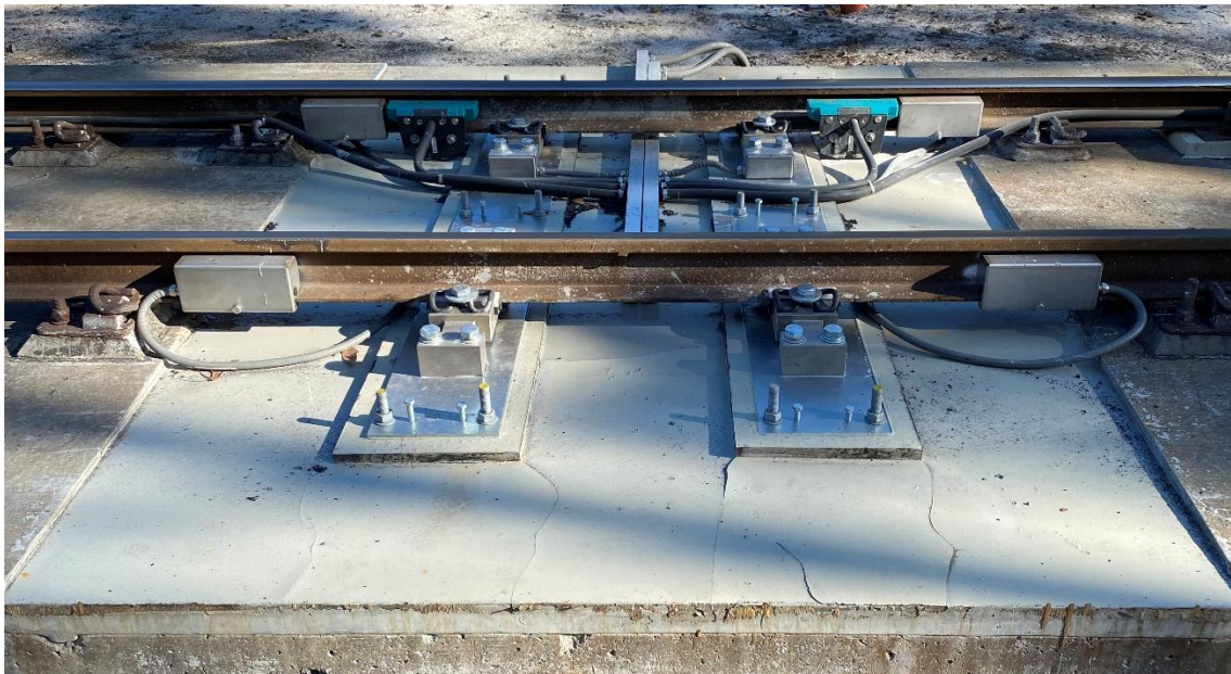
Infinity LS System Load Receptor Incorporating Steel Sleepers and Lateral Force Sensors