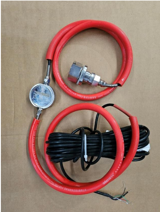
Trakblaze Model XZF-SS-20T Lateral Force Sensor