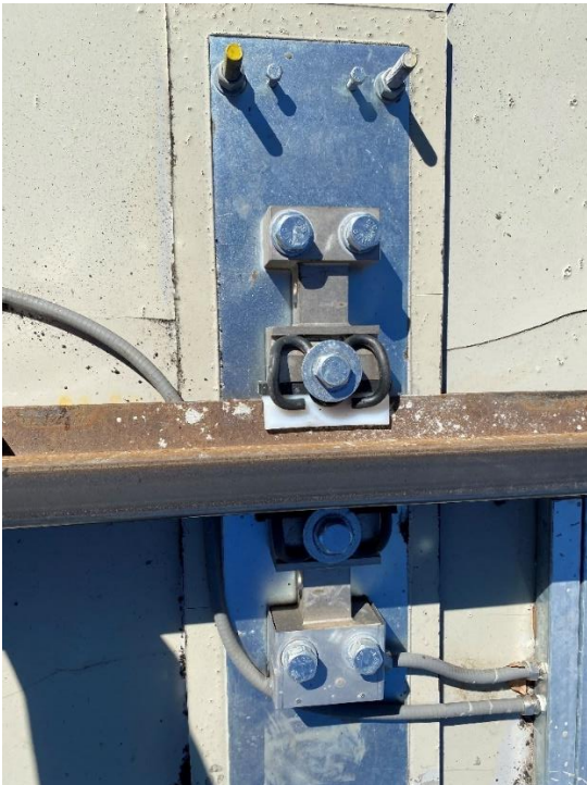
Trakblaze Model TB-INF-15t-130-0 Load Cells