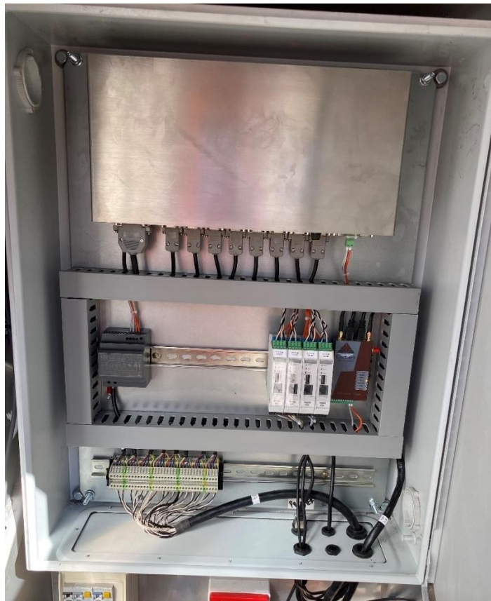
Electronics Cabinet ~ End of Document ~