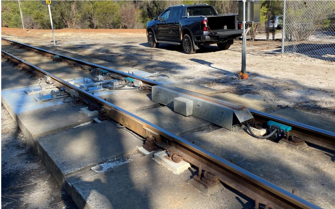
Trakblaze Model TB-INF-15t-130-0 load cell and Track Switch Mounting