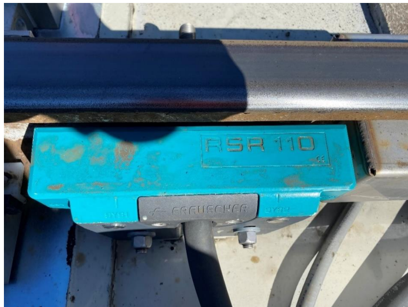
Frauscher Model RSR110 Track Switch