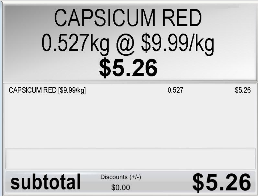
Typical Customer Screen