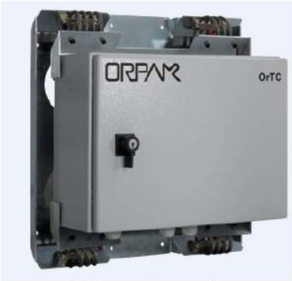
Prime forecourt controller Stand-alone Control System