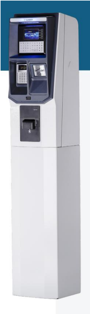
Typical ORPAK Model ORIC Prime Payment Terminal