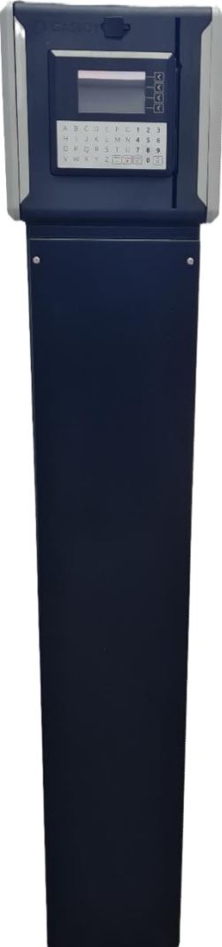
Typical ORPAK Prime UX with Pedestal