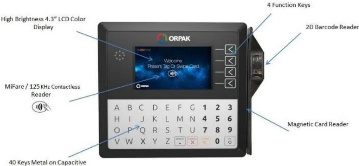
Typical ORPAK Model OrPAY1000 Terminal Installations in Various Fuel Dispensers