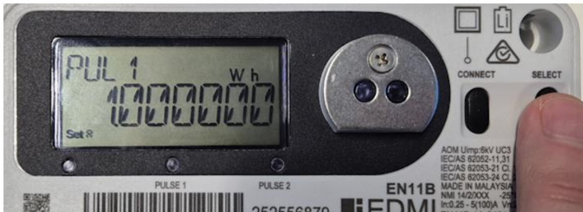
FIGURE 14/2/118 – 2

The meter constant for active energy accessible on the meter display