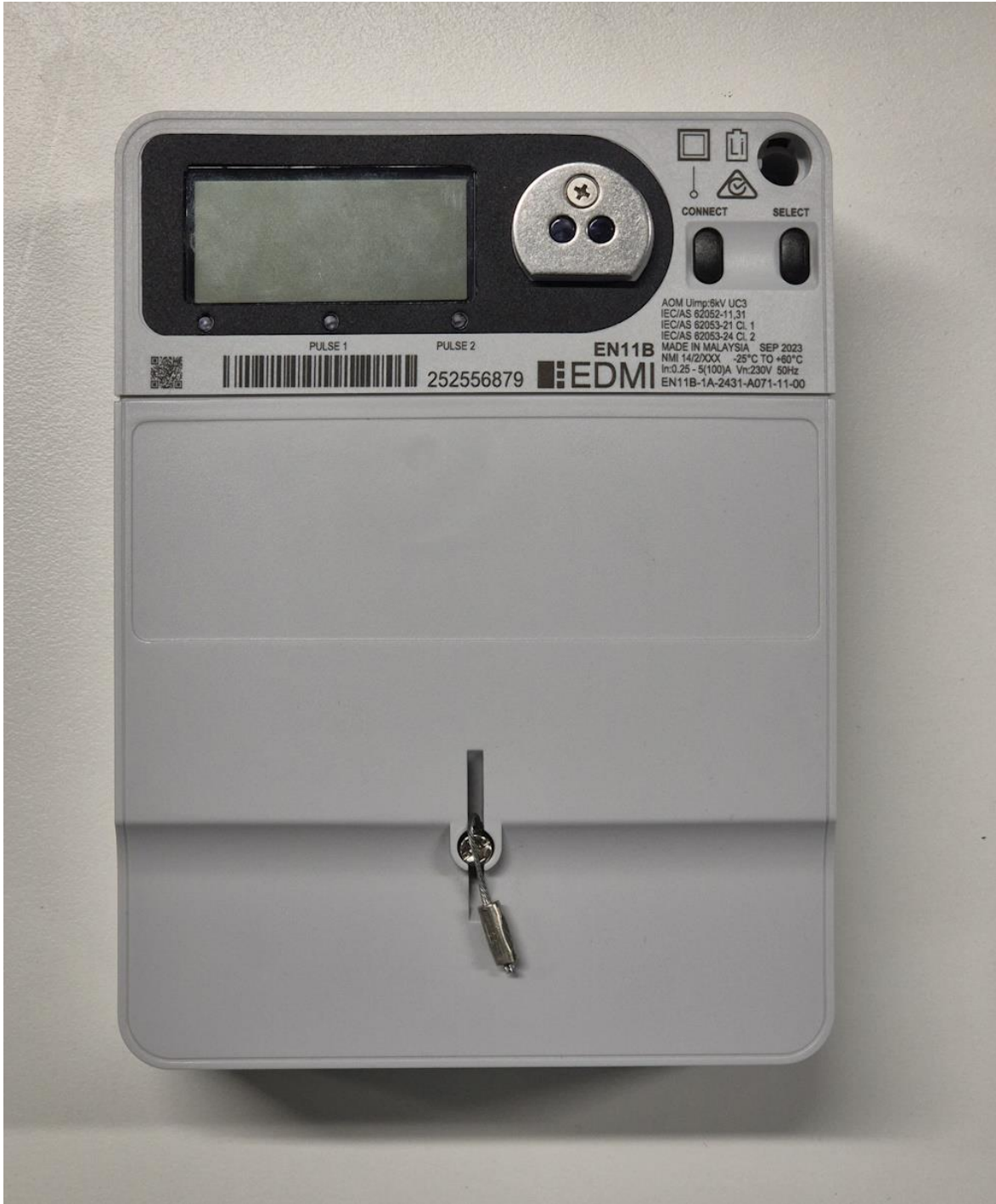
EDMI Pty Ltd model Neos EN11B Electricity Meter (the pattern, including typical mechanical sealing)