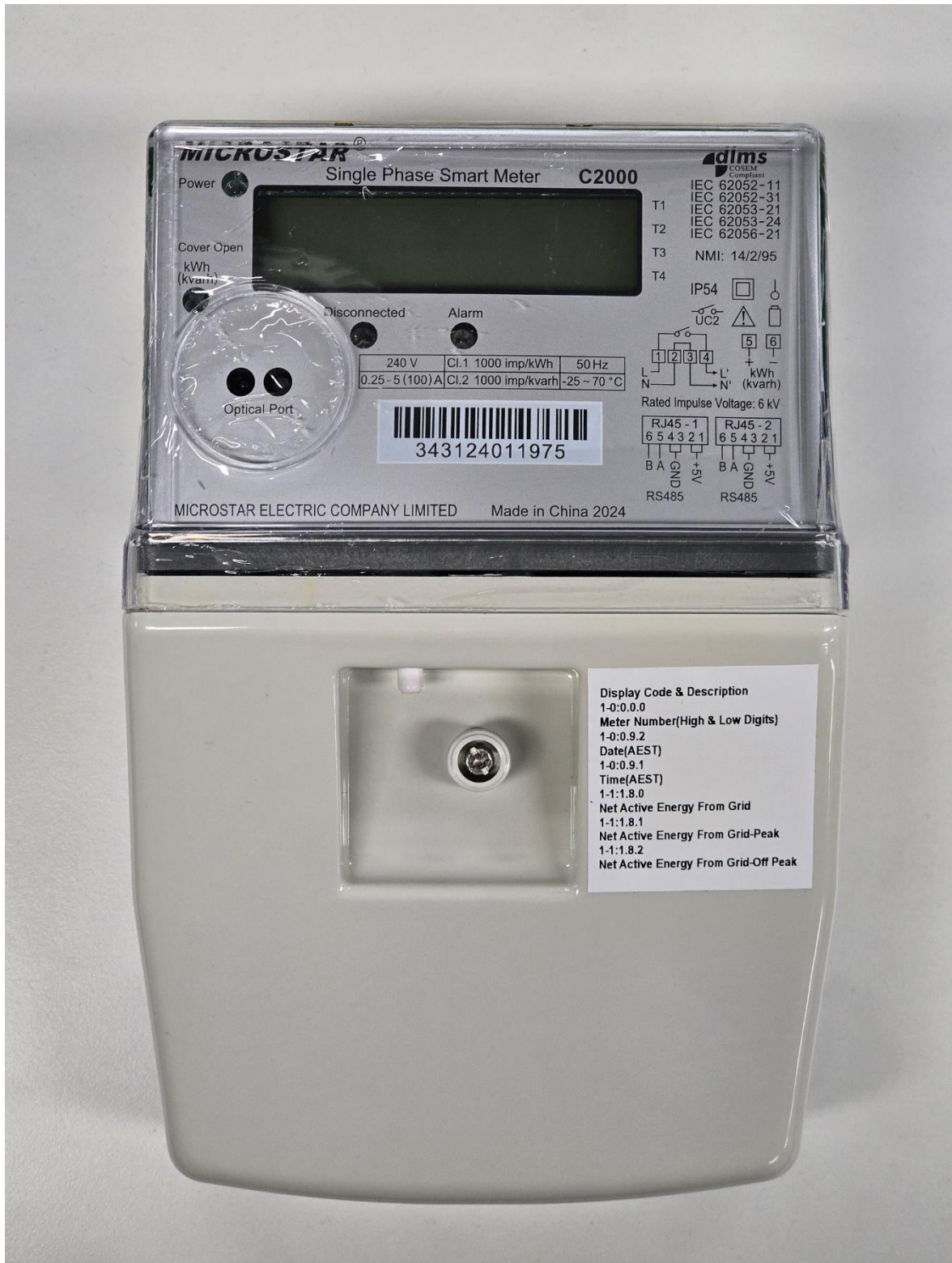
Microstar Model C2000 (Variant 1)