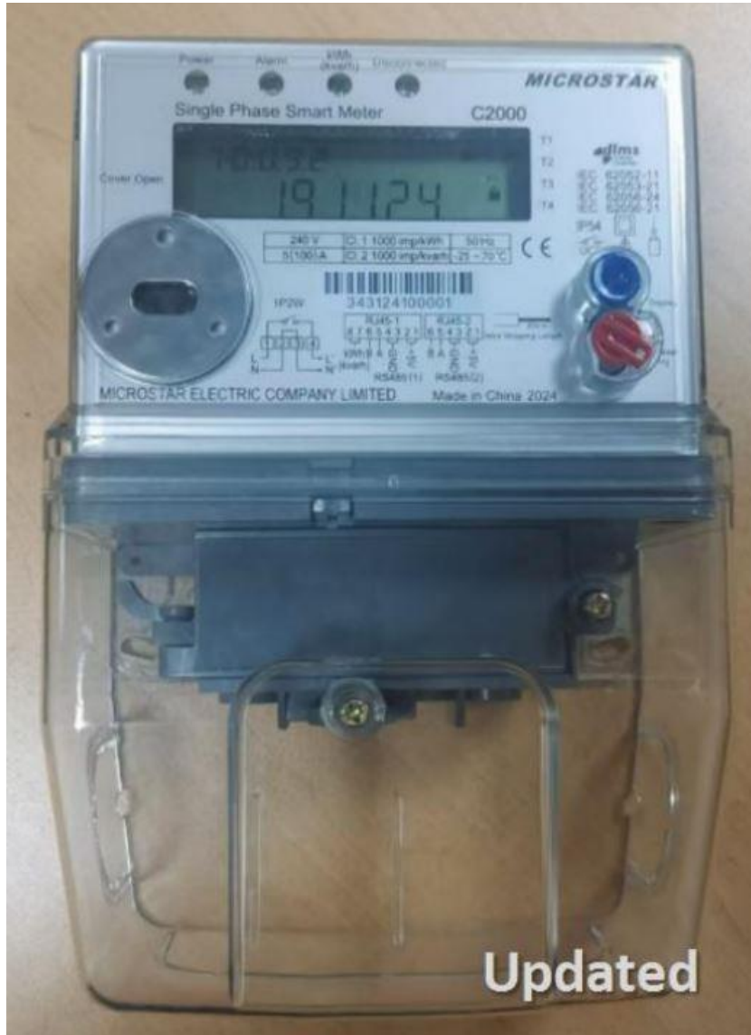
Microstar Model C2000 (Variant 2)