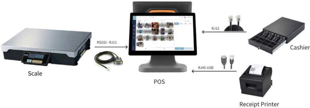
Point of Sale (POS) System