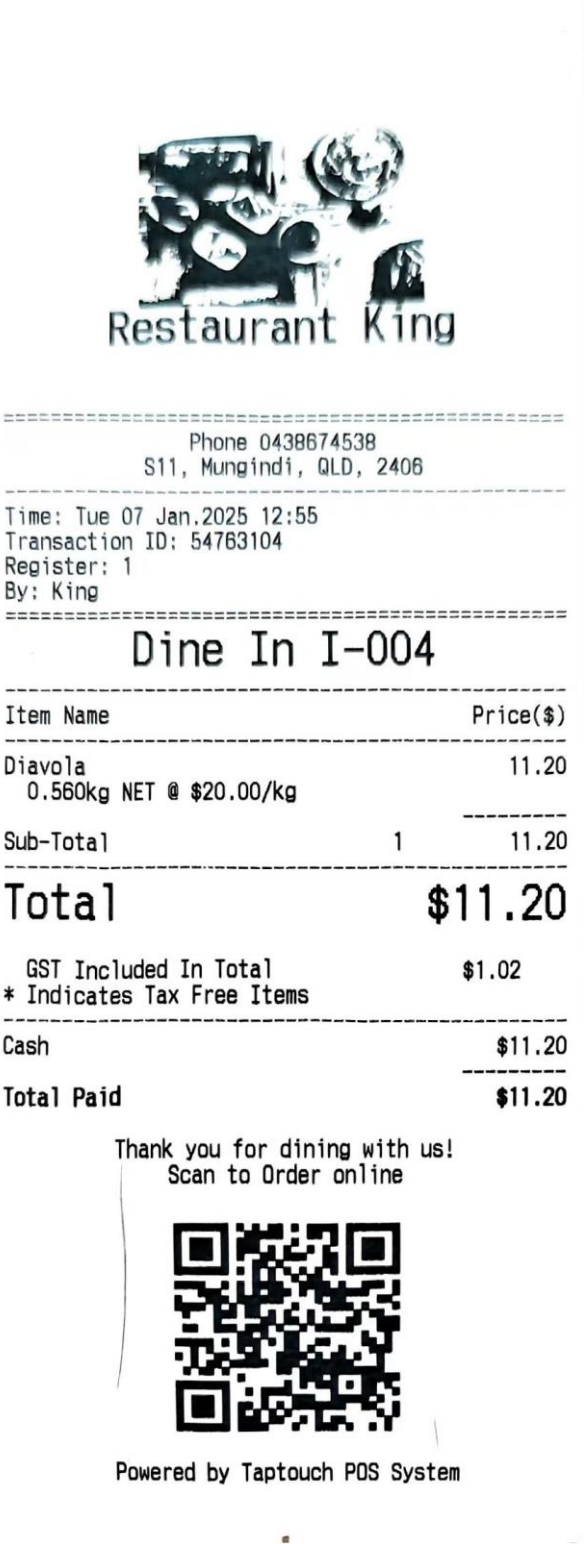
A Typical Receipt