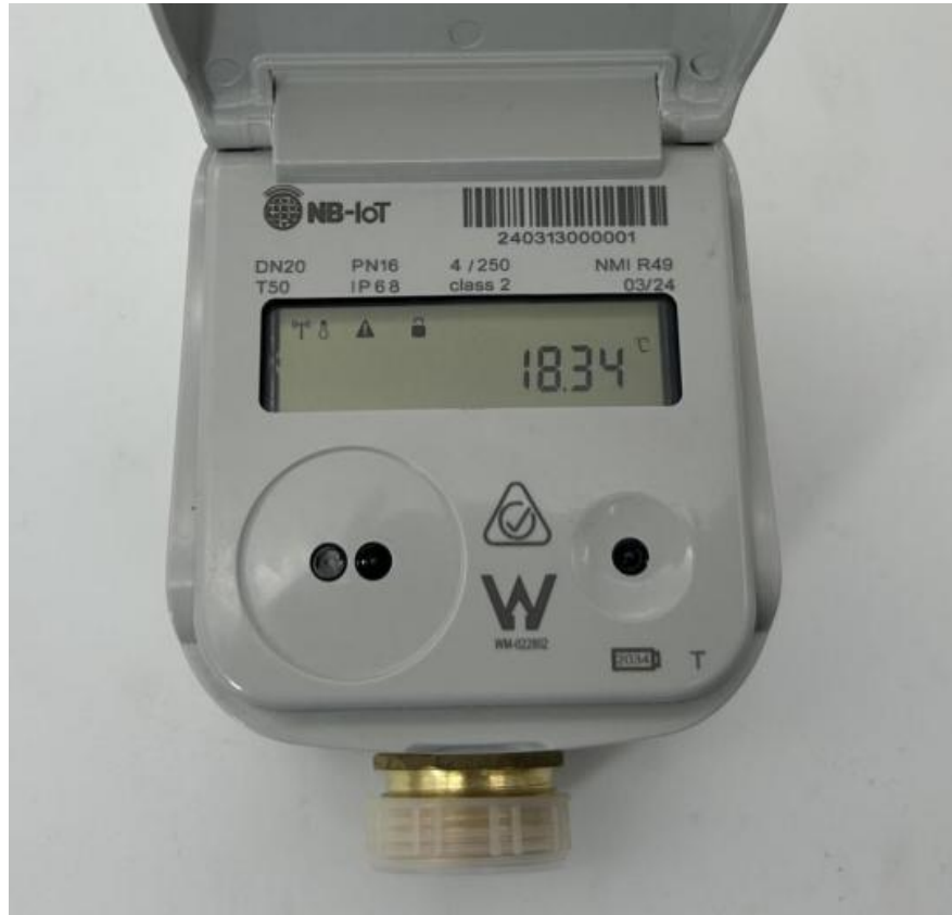
Sanchuan DN20 Series Ultrasonic Water Meter – Indicating device