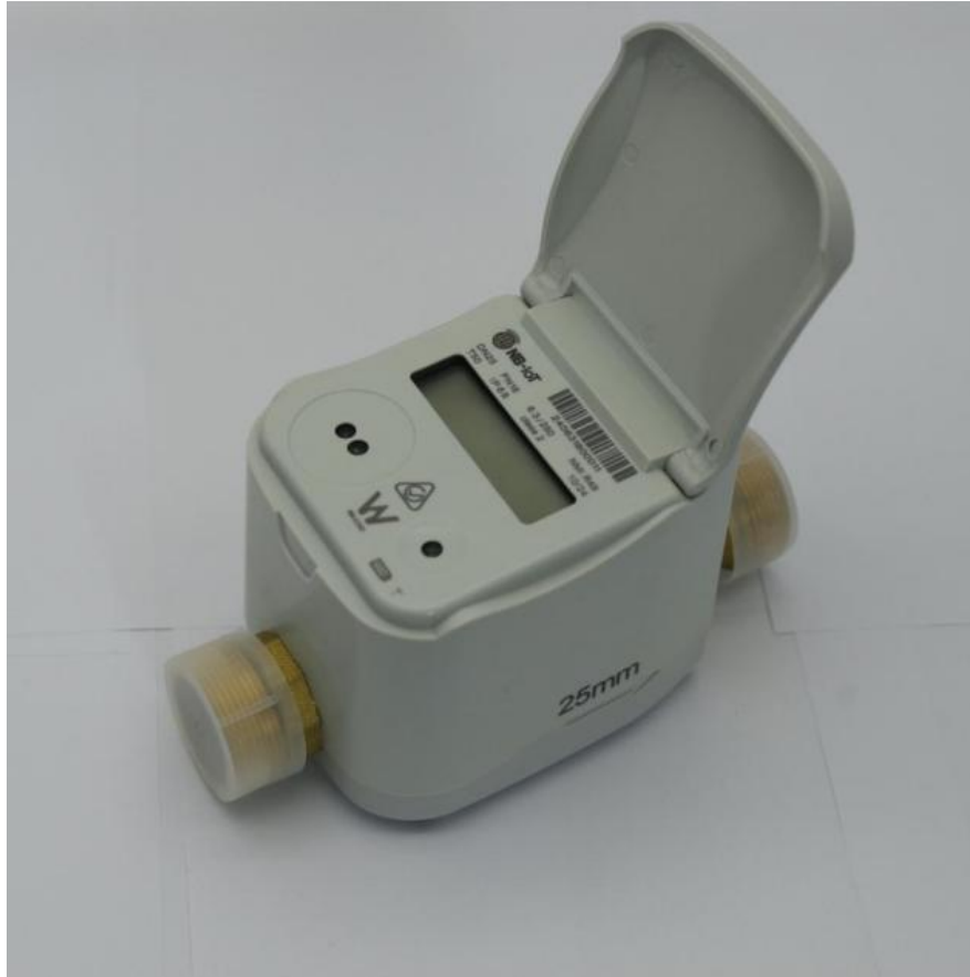
Sanchuan DN25 Ultrasonic Water Meter – (Variant 2)