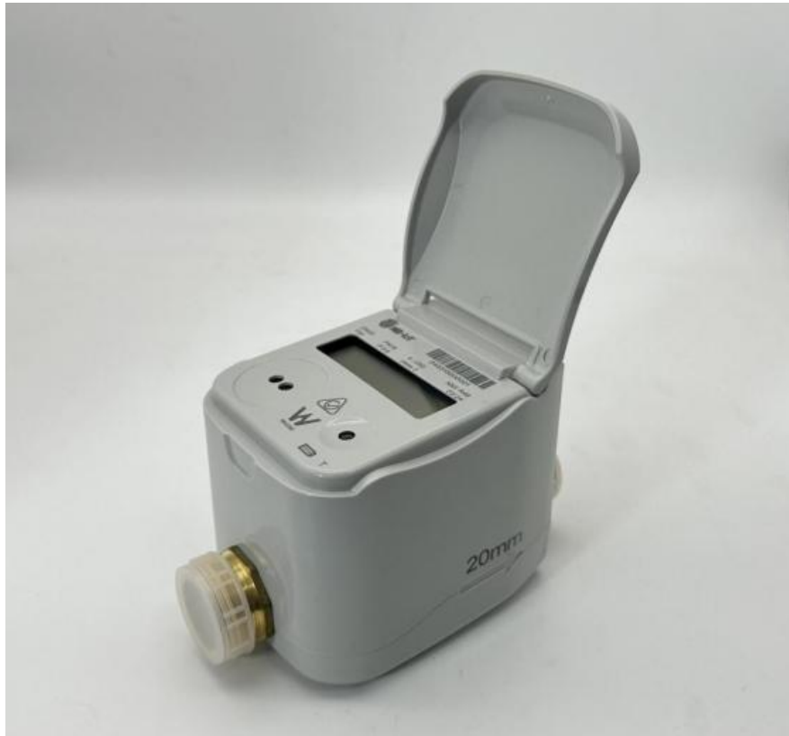
Sanchuan DN20 Ultrasonic water meter – (the Pattern)