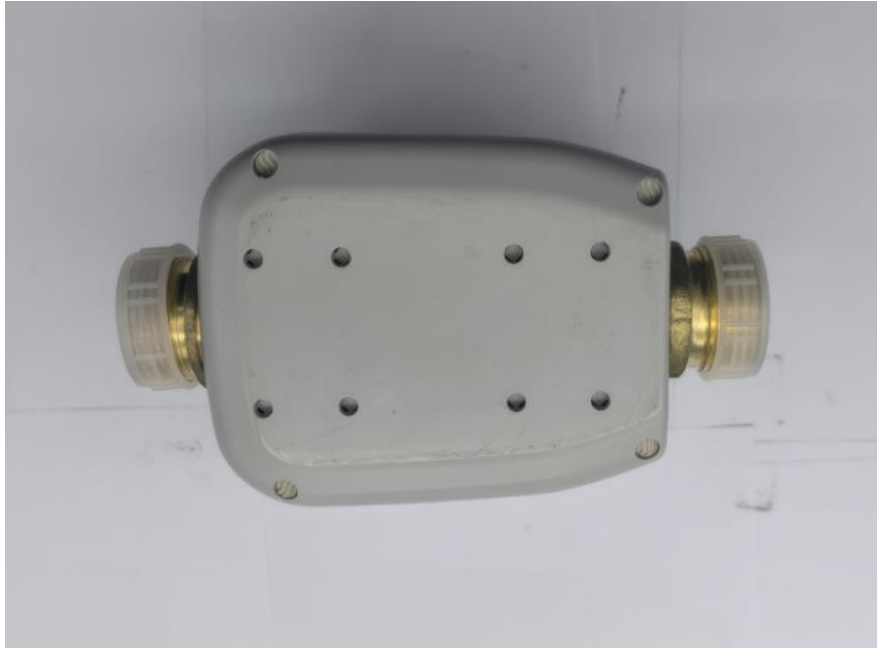
Sanchuan DN20 Series Ultrasonic Water Meter – Sealing