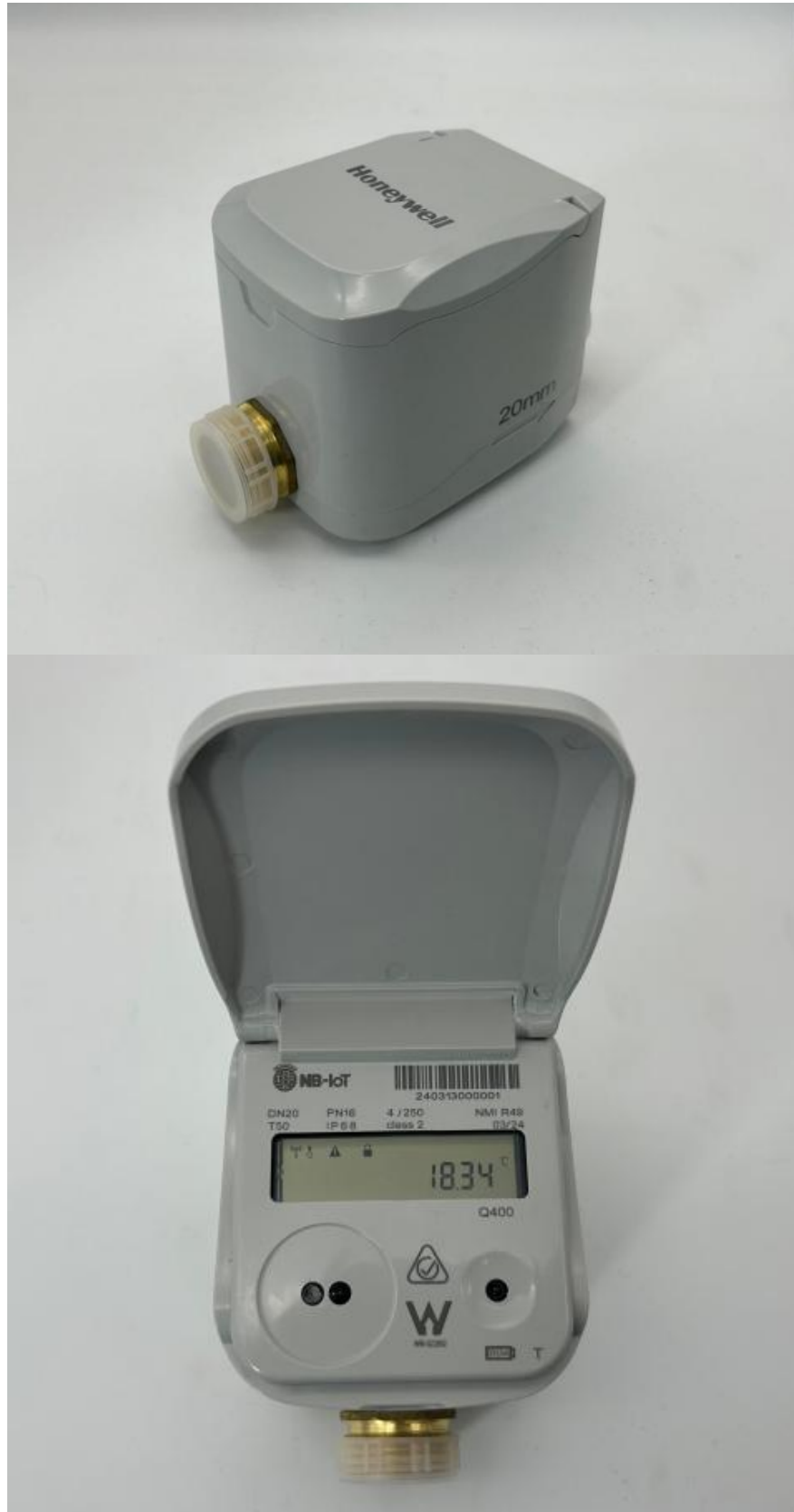
Alternative branding – Elster Honeywell Q400 (Variant 3)