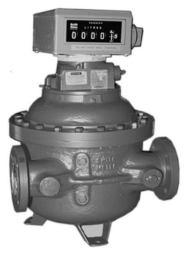
FIGURE 5/6B/55B - 3

Smith Meter Inc Model S4-1-ST-R2 Gas Extractor With Integral Strainer