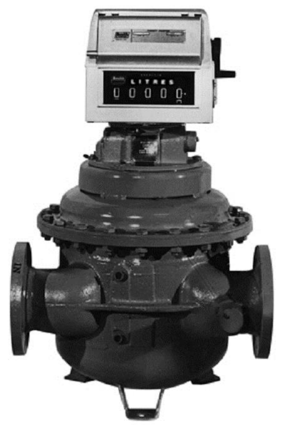
FIGURE 5/6B/55B - 7

Smith Meter Inc Model LSD-3/LSD-30 Flowmeter With Veeder-Root Indicator, Printer and Pre-set