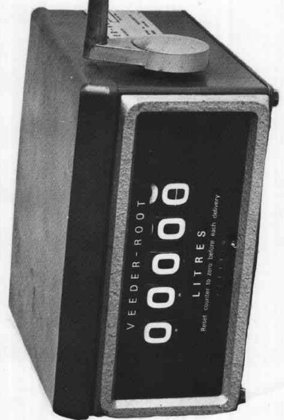
FIGURE 5/6B/44 - 4