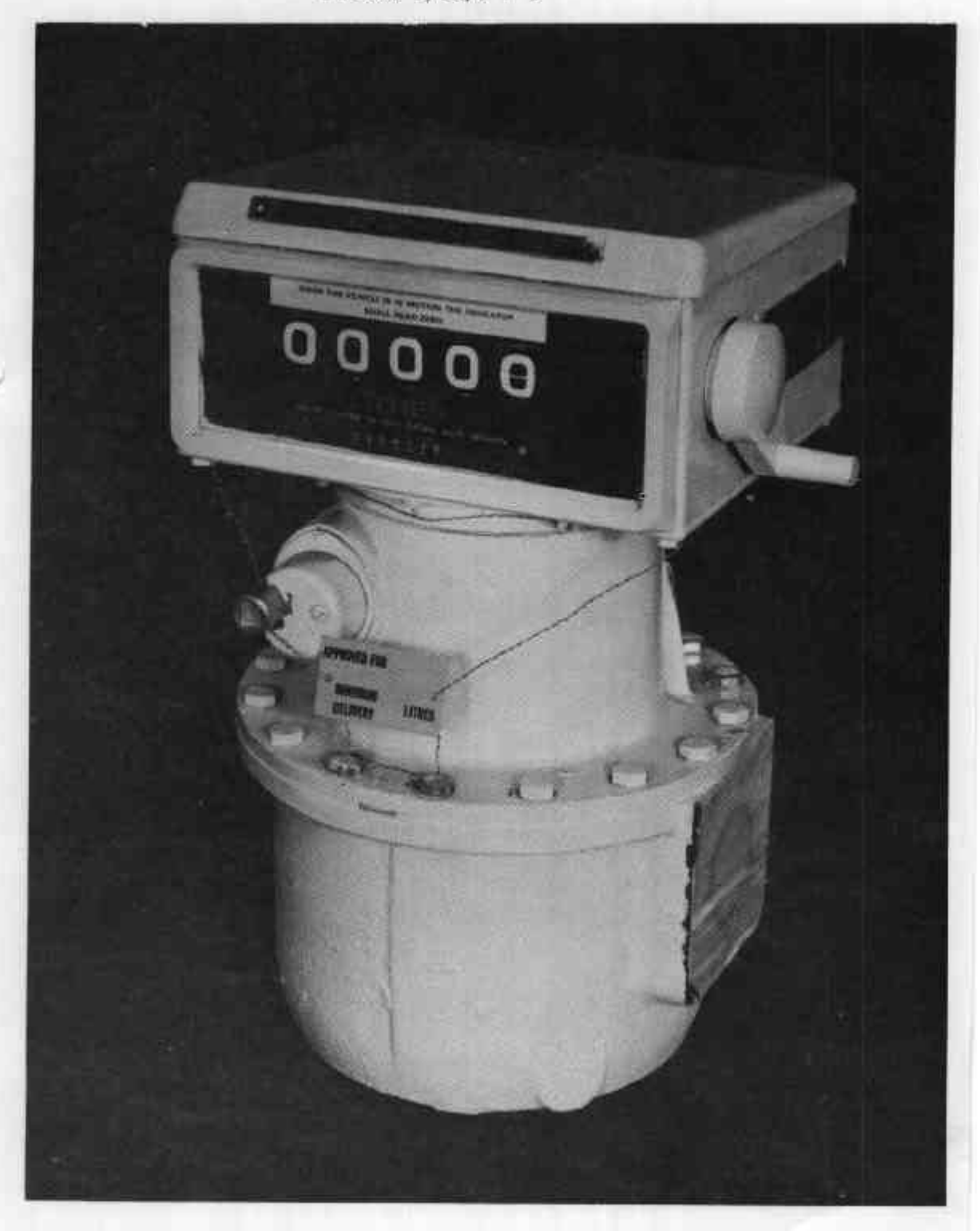
A. O. Smith Tll Meter with Veeder-Root 1624 Indicator 24/3/78