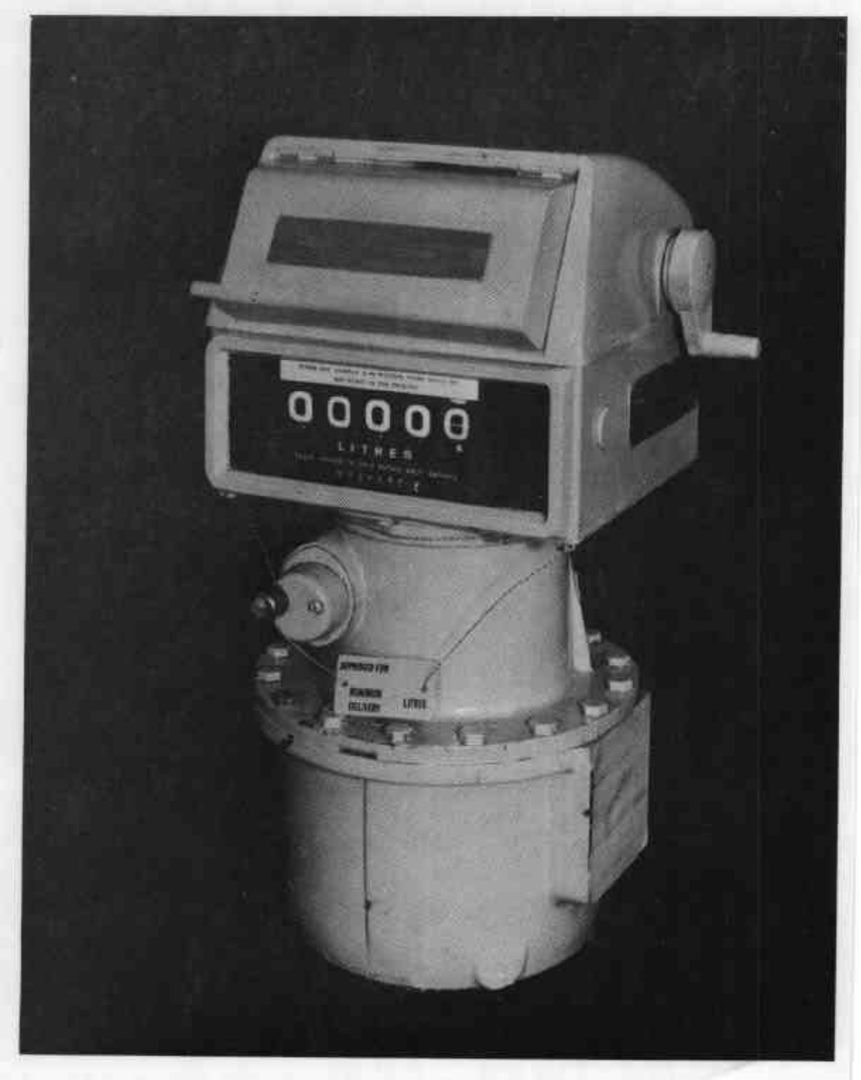
A. O. Smith Tll Meter with Veeder-Root 7085 Indicator and Ticket Printer