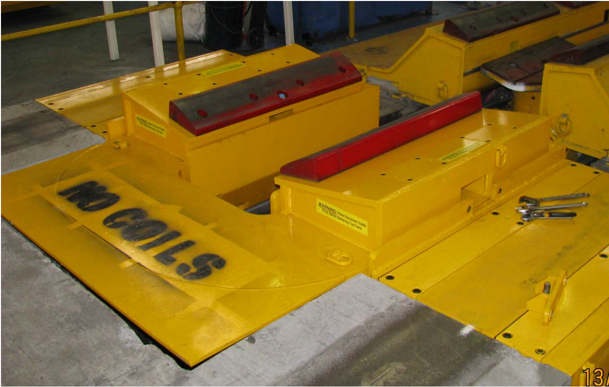
With U-shaped Load Receptor – Variant 4