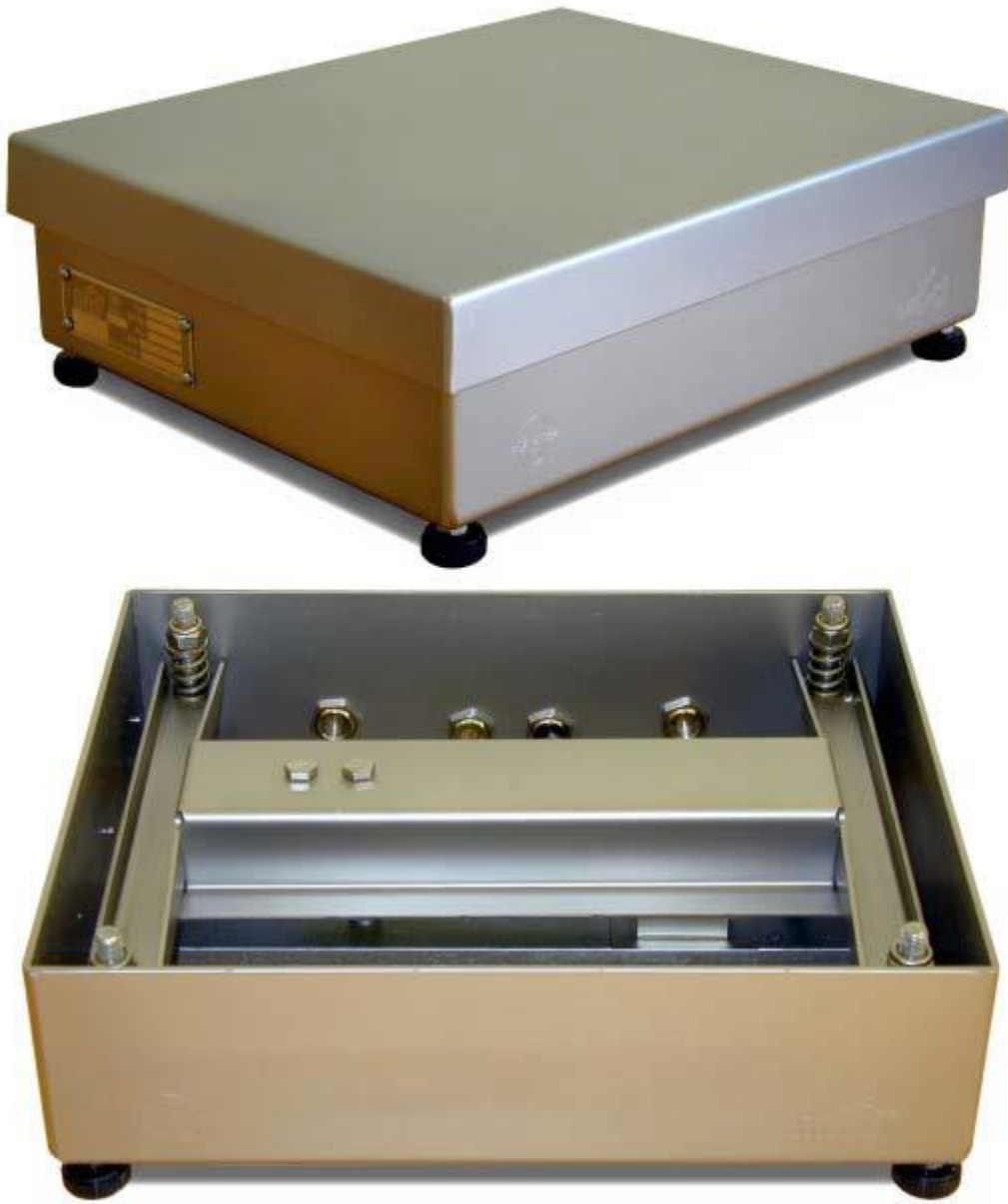
Marel Model PL2010 Basework