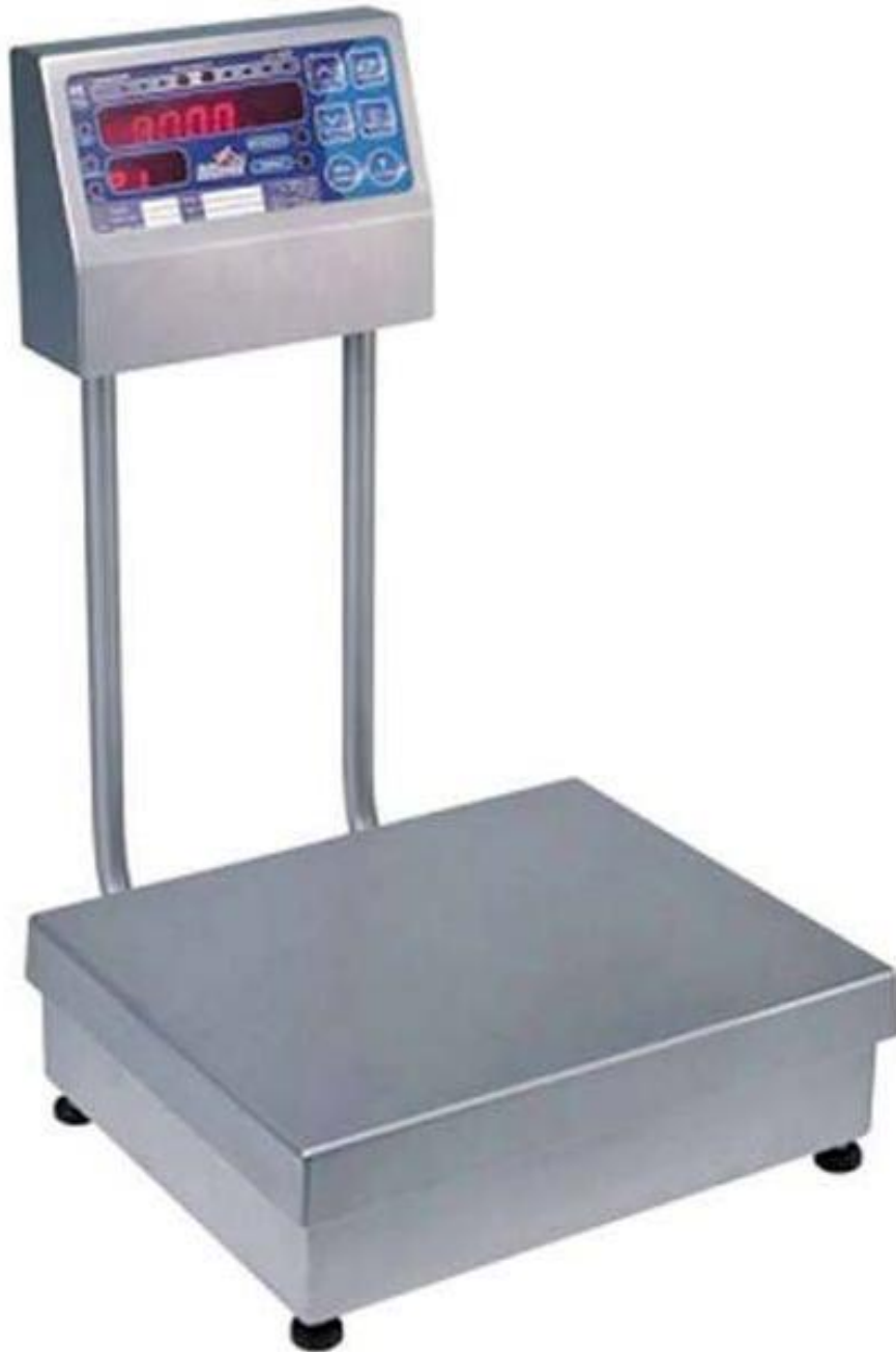
Marel Model M1100-C2 Weighing Instrument