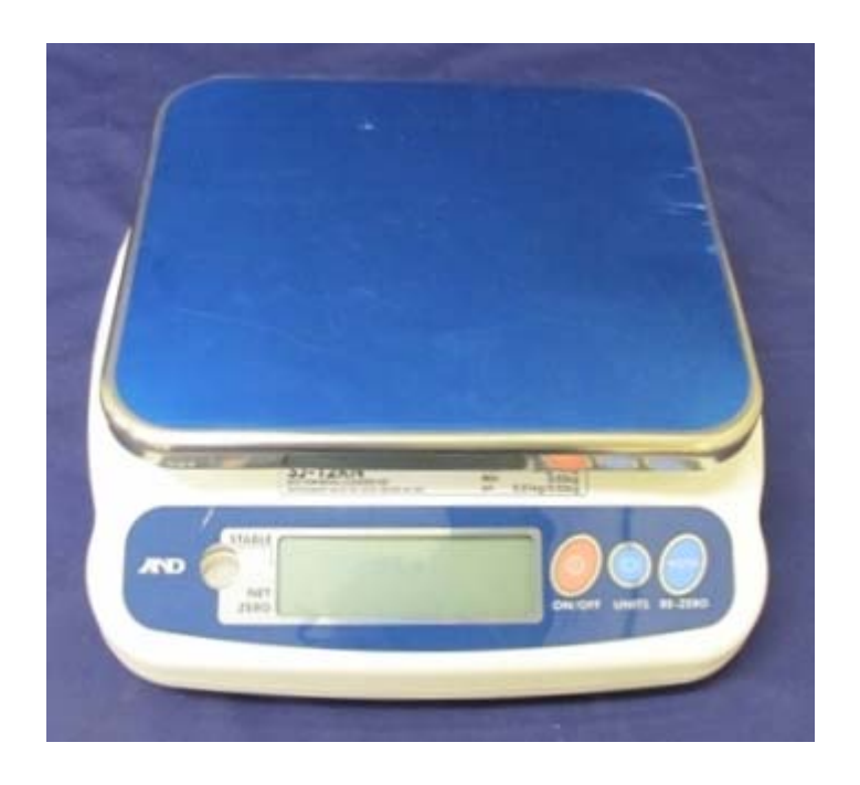
A&D Model SJ-12KN Weighing Instrument