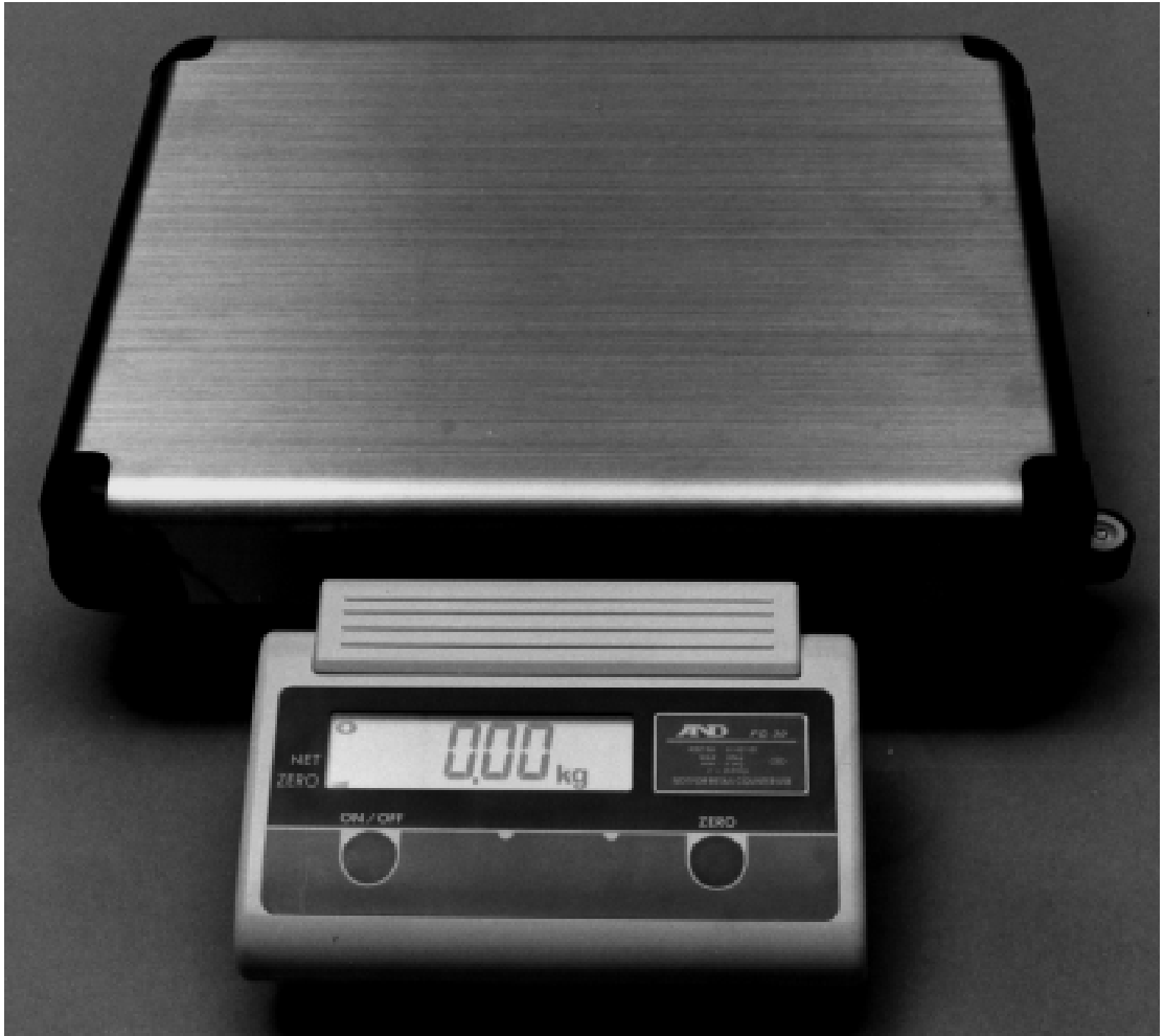
A & D Model FG-30K (or FG-30) Weighing Instrument