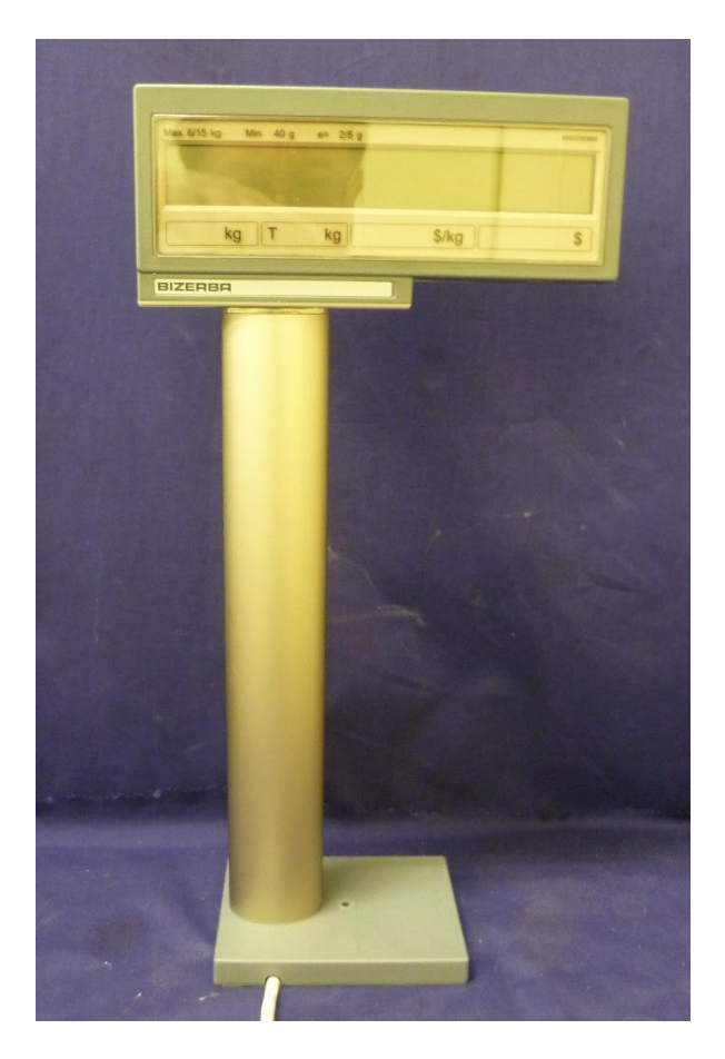
Bizerba Model P Display