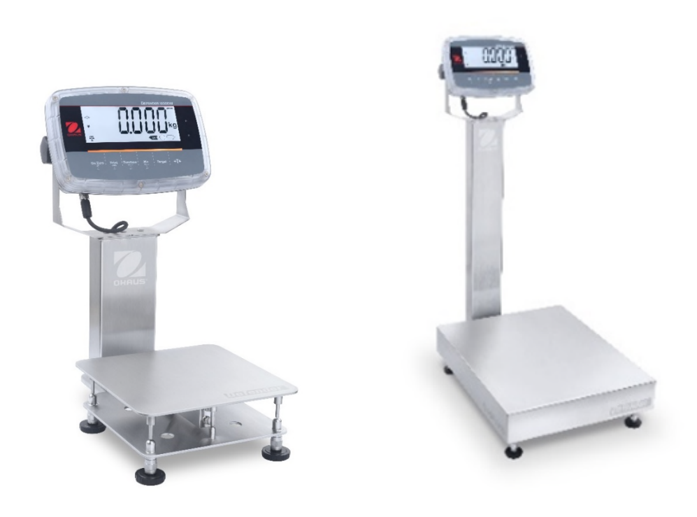
Ohaus Model Defender i-DT61PW Series Weighing Instrument