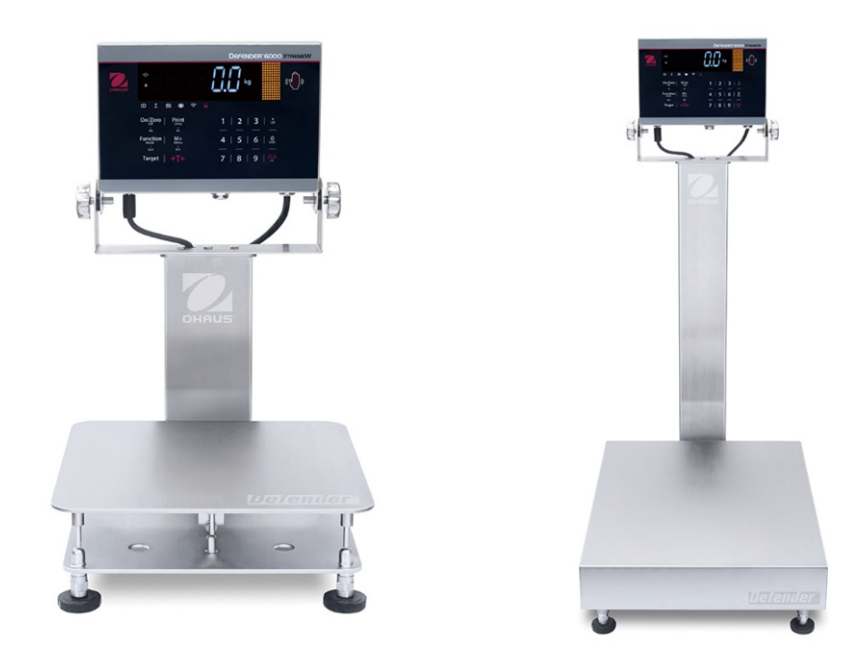
Ohaus Model Defender i-DT61XWE Series Weighing Instrument