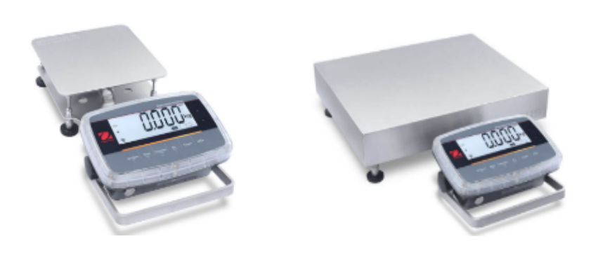
FIGURE 6/4C/326 - 2

Ohaus Model Defender i-DT61PW Series Weighing Instrument (Bench Style)