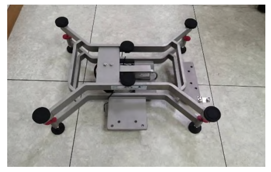
(b) Ohaus Model Defender i-D61PW / i-D61XWE Series Basework Fitted with an HBM PW15AH Load Cell