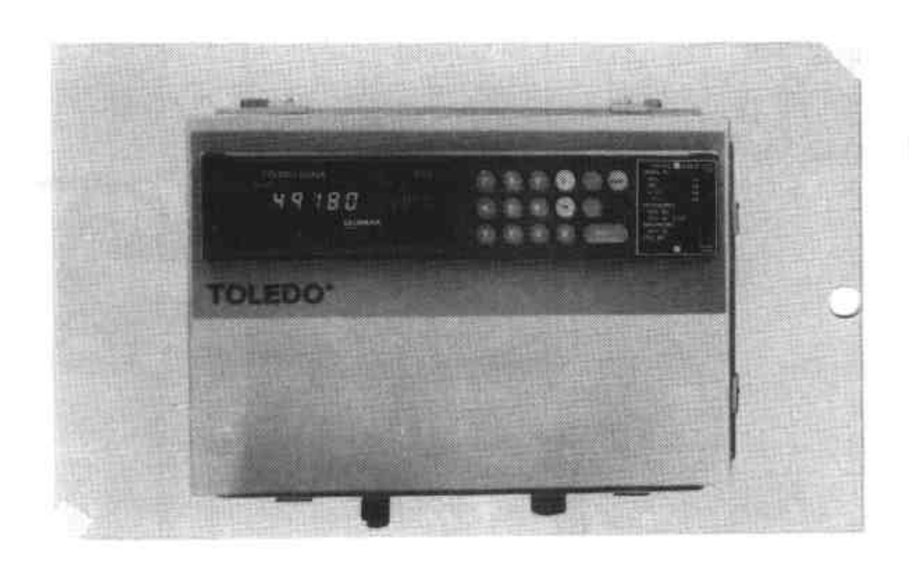
FIGURE 6/18/18 - 2