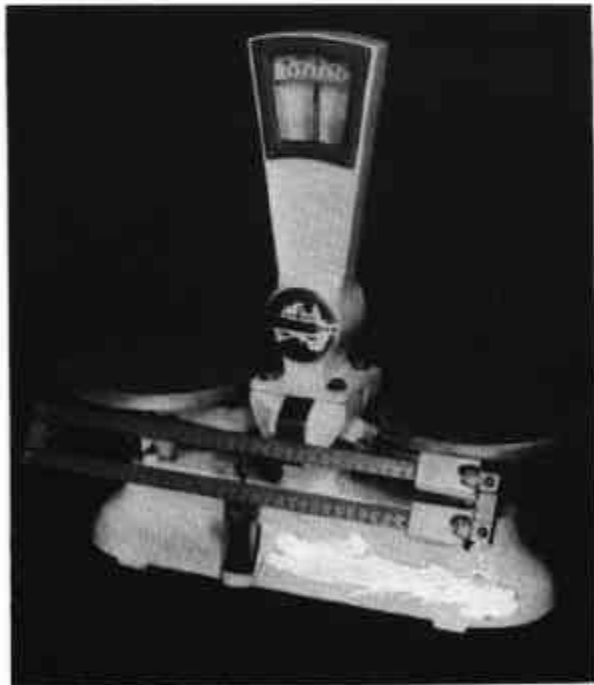
James Wedderburn Protector Scale