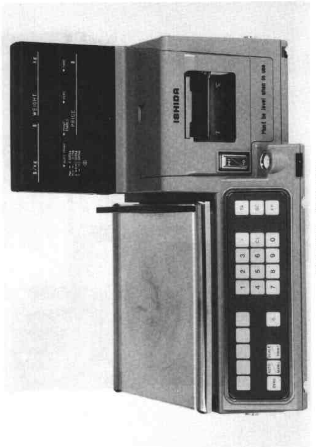
FIGURE 6/4D/212 - 1