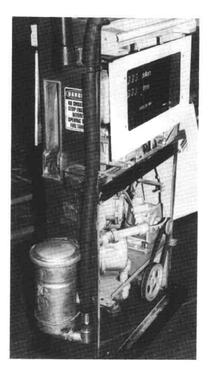
FIGURE S242A - 1

Typical Model DK04717 Filter Installation