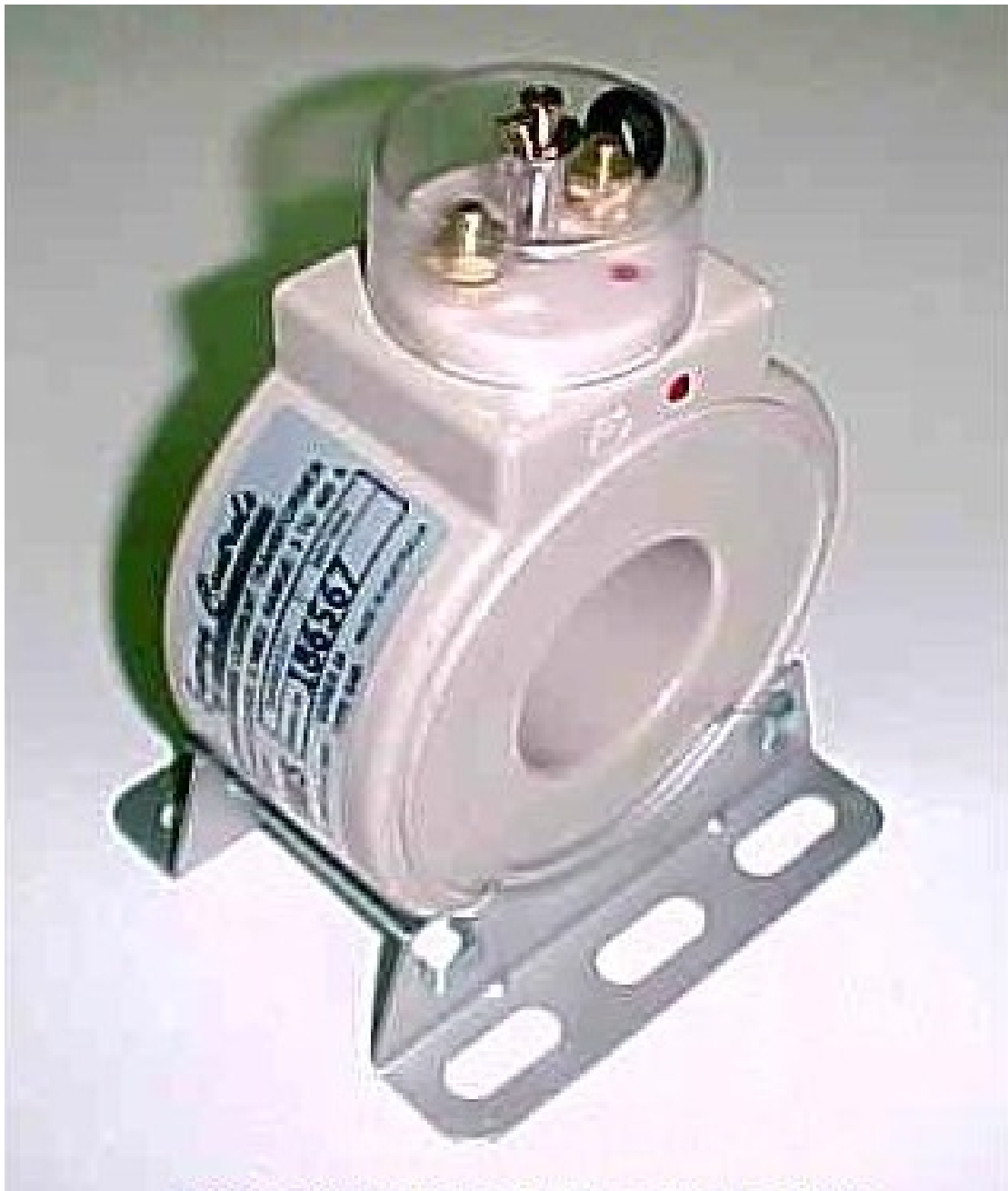
WF Energy Controls Model S/45 Current Transformer