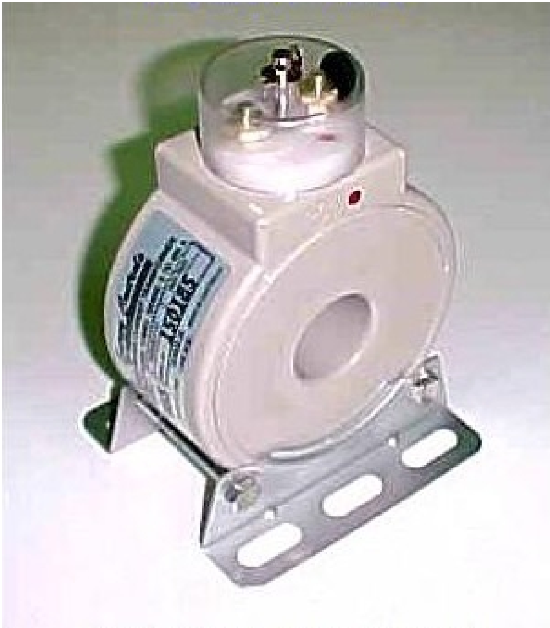
WF Energy Controls Model S/32 Current Transformer