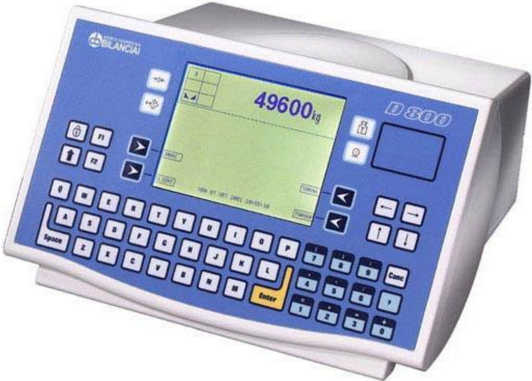
Bilanciai Model D800 Digital Indicator