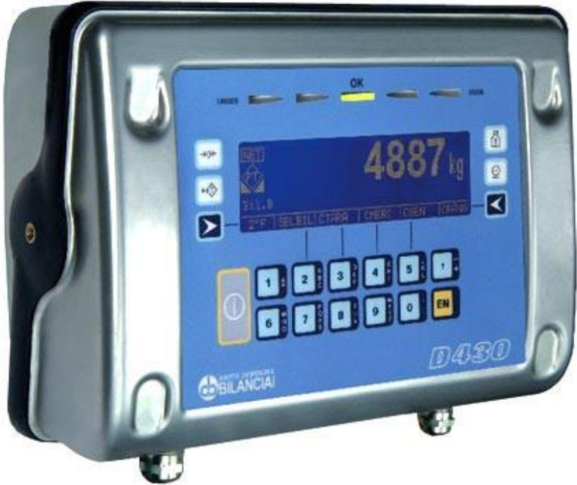
Bilanciai Model D430 Digital Indicator