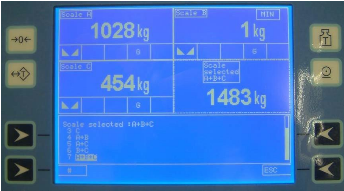
(a) Typical indication