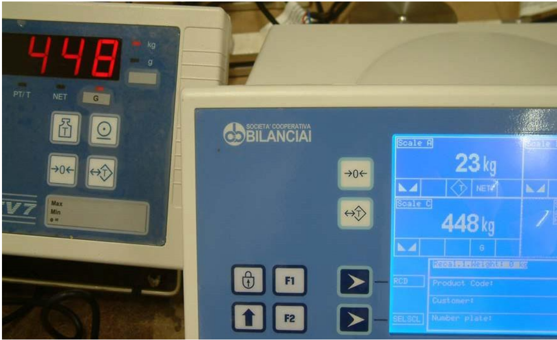
(b) Showing separate display of third basework