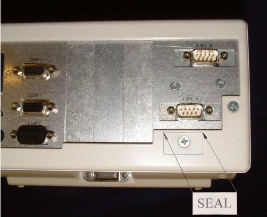
Sealing of Bilancai Model D800 Digital Indicator