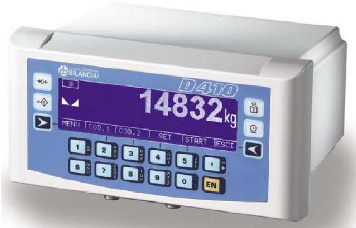
Bilanciai Model D410 Digital Indicator