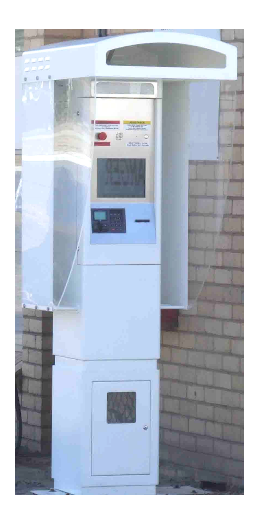
Quest Model QOPT V1 Control System (Pattern)