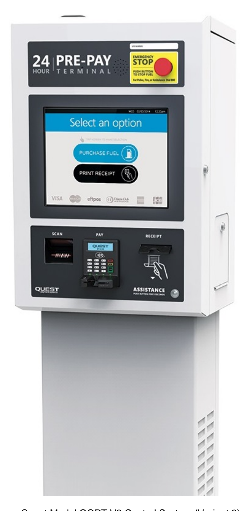
Quest Model QOPT V2 Control System (Variant 2)