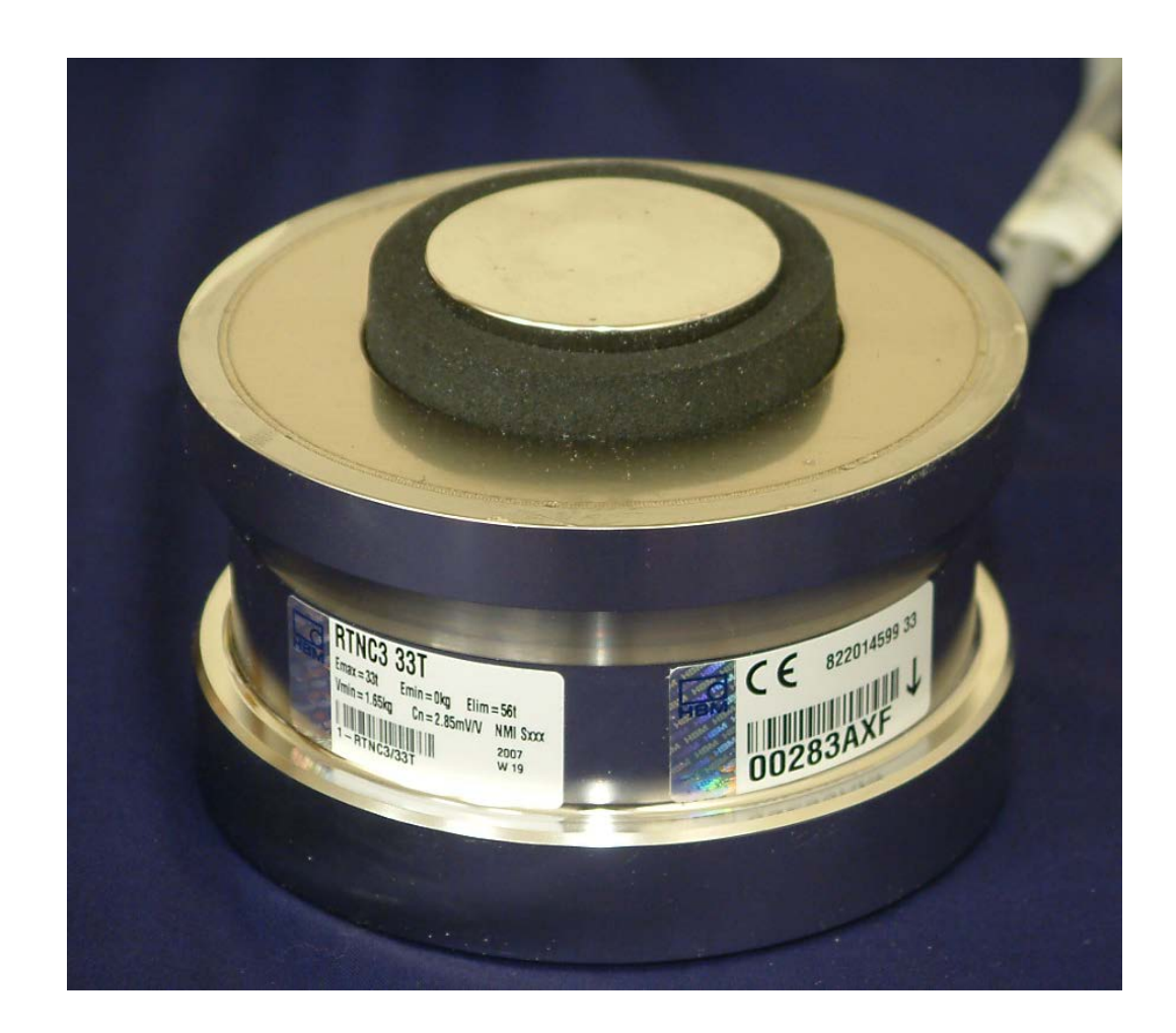
FIGURE S499 - 1