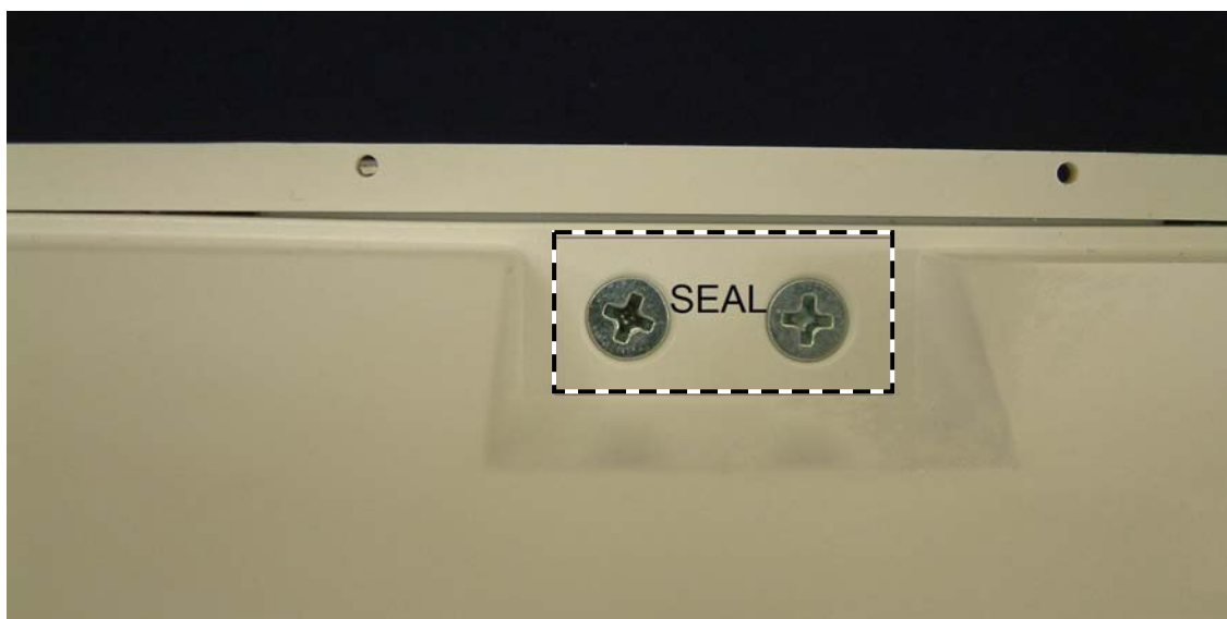
(b) Seal instrument casing