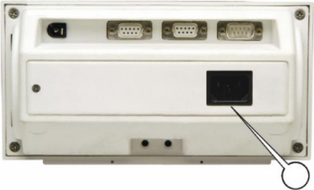
(b) Rear View – note IEC socket which distinguishes from model 70A