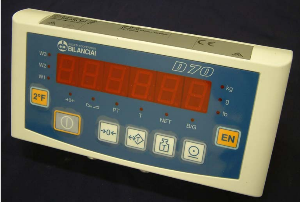
(a) Front View