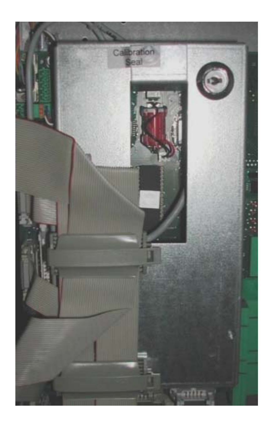
Typical Mechanical Sealing