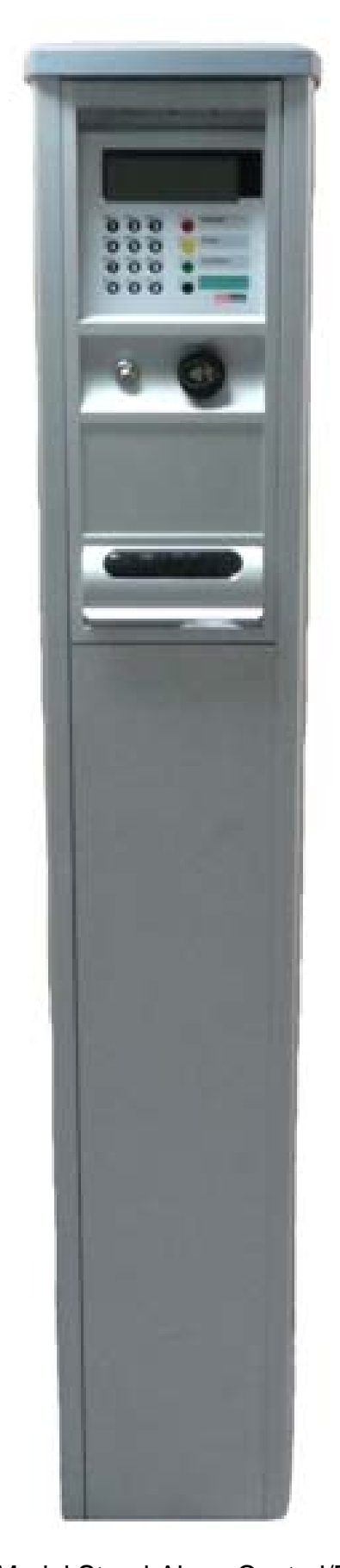
Hectronic Model Stand-Alone Control/Display Unit