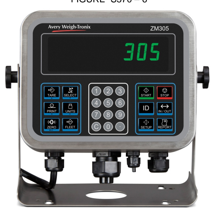
FIGURE S570 - 6

Avery Weigh-Tronix Model ZM305-SG1 Digital Indicator (Variant 7)