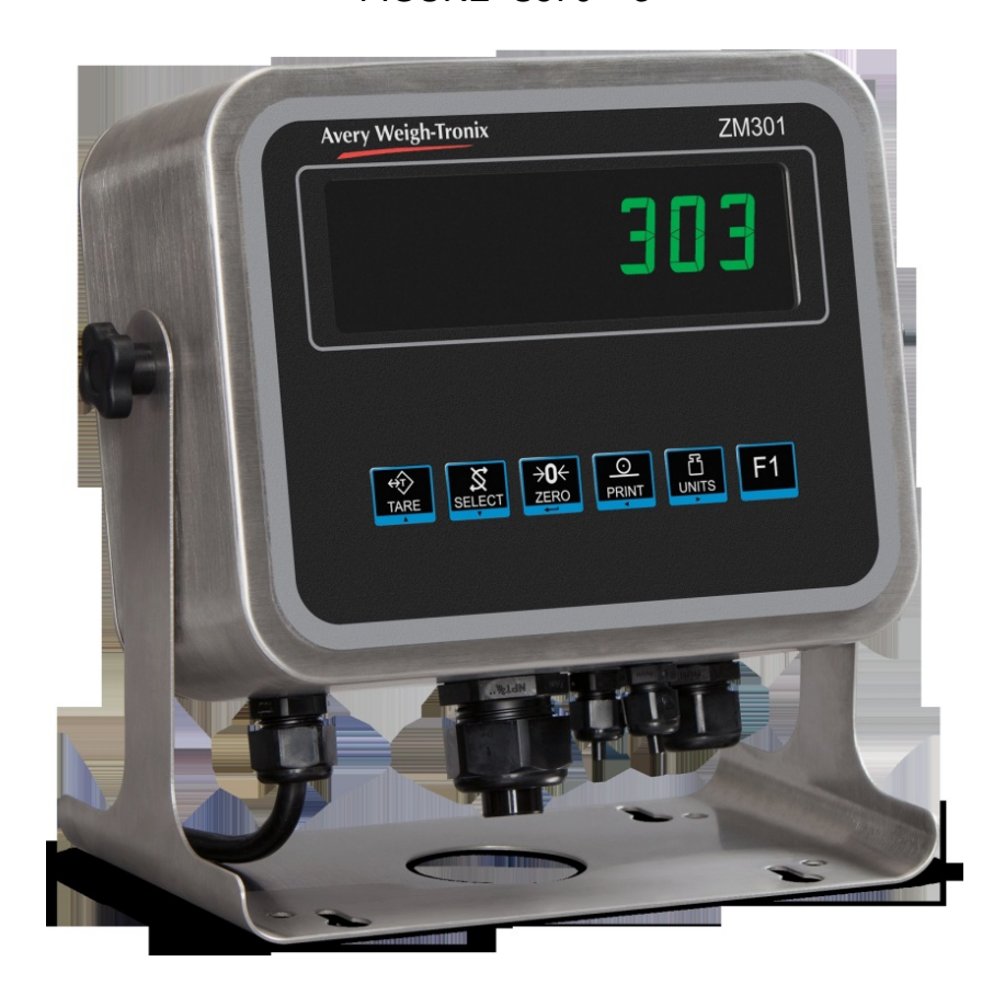
FIGURE S570 - 3

Avery Weigh-Tronix Model ZM301 Digital Indicator (Variant 1)