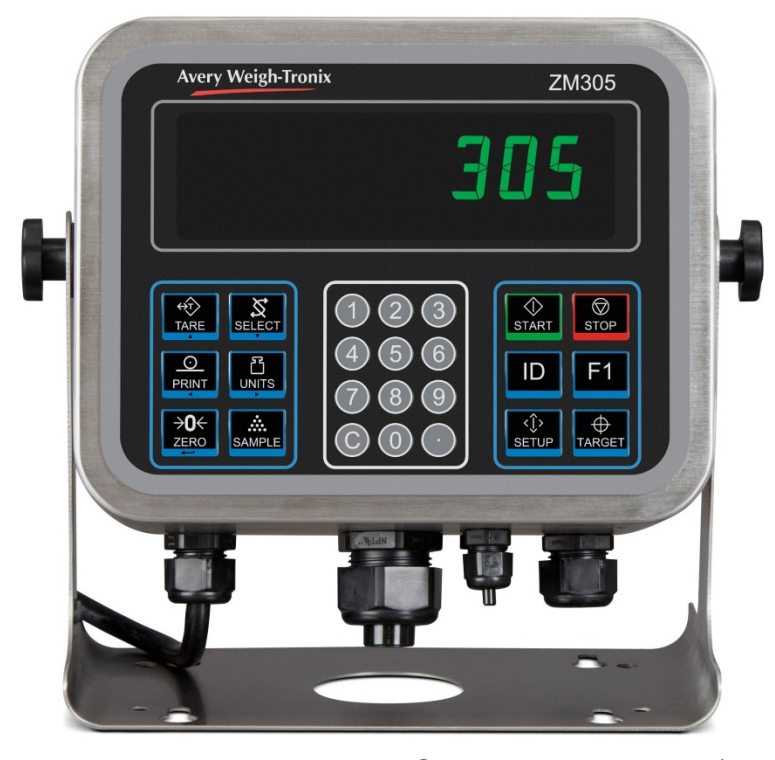
FIGURE $570 - 5

Avery Weigh-Tronix Model ZM305-SD1 Digital Indicator (Variant 6)