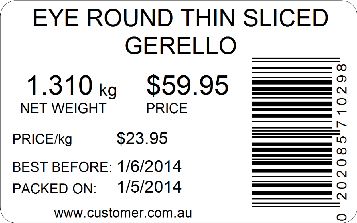
A Typical Label